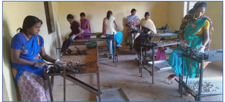
A cashew processing unit at Bastar

The amount of the CEF loan was majorly utilized for the repair and maintenance of the machinery equipment required to process cashew nuts. Along with this, 15 quintal of raw cashew nuts were collected with the help of SHG members to make the unit operational at the earliest. The unit began to operate in October 2018. The unit sells raw, full, half and four quart cashew nuts in the market and gradually the income has increased to Rs. 90,000 to Rs 1,00,000 per month. The profit, distributed among the entrepreneurs, has improved their lifestyle and in turn their social values.