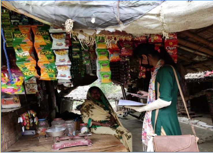
Enterprise Census being undertaken in Bankati block, Uttar Pradesh