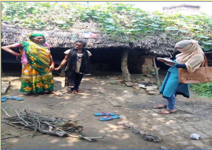
Household survey being conducted in Pipraich block, Uttar Pradesh