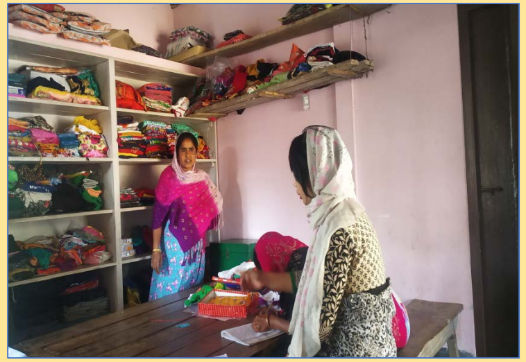
Preparation of Performance Improvement Plan initiated in Sidli-Chirang, Assam