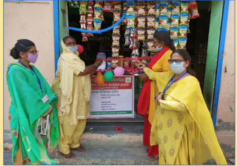
Enterprise promotion activities resume in Sahaspur, Uttarakhand