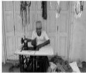
A tailor sews facemasks at a roadside stall during lockdown, in Silliguri on Monday.

These micro enterprises have been trained by Ahmedabad-based Entrepreneurship Development Institute of India (EDII) under the Start-up Village Entrepreneurship Programme (SVEP), a sub-scheme of National Rural Livelihood Mission (NRLM) of the Union Ministry of Rural