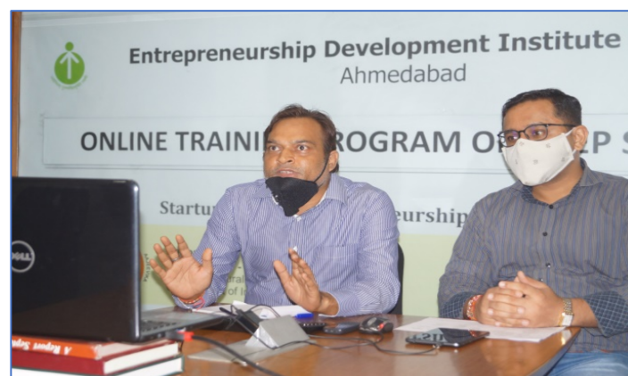
Resource persons during the session

20 participants from Andhra Pradesh, Bihar, Jharkhand, Madhya Pradesh, Odisha, Rajasthan and West Bengal participated in this Online training programme. The participants were made familiar with each feature of the SVEP web and mobile app. Practice sessions and an online test for the participants were also conducted as a part of this training programme.