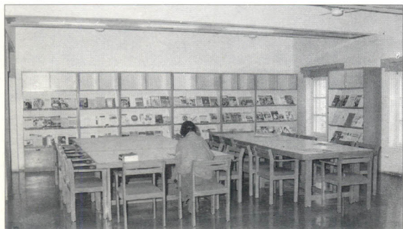
EDI Library & Information Centre