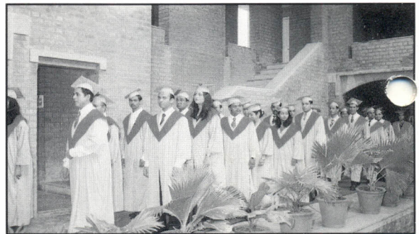
PGDBEM & PGDMN students seen in the convocation procession