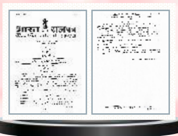
Recognized as Centre of Excellence by Ministry of Skill Development & Entrepreneurship, Govt. of India