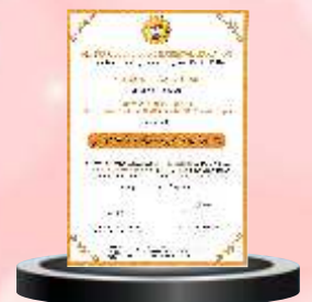
AICTE Lilavati Award 2020 on Women Empowerment (First Runner-Up)