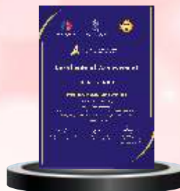
Ranked No. 1 under General (Non-Technical) Category by Atal Ranking of Institutions on Innovation Achievements (ARIIA)-2021, Ministry of Education, Govt. of India