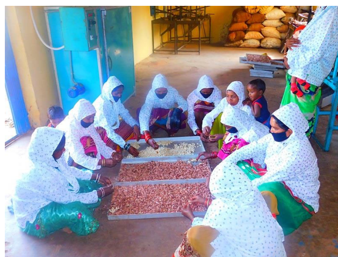
Figure 1: Cashew Processing unit run by the women Entrepreneurs supported under SVEP

“We had necessary infrastructure and resources but didn’t have technical knowhow and forward linkages. SVEP helped us to restore the cashew unit as well as our livelihood. Entrepreneurship Development Programme (EDP) under the project SVEP, has enhanced our skills to manage the enterprise and has made us self-sustainable.”