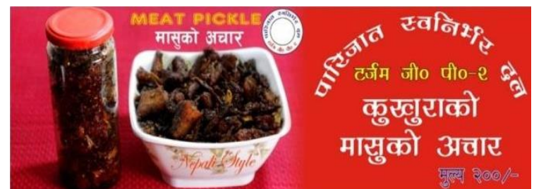
Figure 4: The branding and logo printing of the enterprise is also accomplished with an extensive range of meat based pickle product range they sell at affordable prices.

Their products are mostly supplied to retailers and surrounding customers. Each member earns a minimum of Rs. 4500 presently. It has helped them to meet their household expenses to a great extent. Members of this group enterprise always ensure that their food items are sold at a reasonable price.