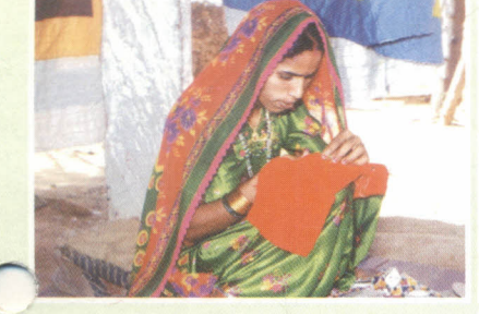
AHMEDABAD (10-16 December 2007) & LUCKNOW (4-10 February 2008)