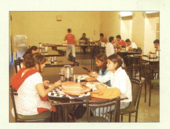
Facilities at EDI Campus, Ahmedabad.