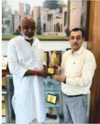
Shri Sanjay Paswan, MLC (Bihar) and Former Union Minister during his recent visit to EDII. Discussions revolved around 'entrepreneurship as a development strategy.'