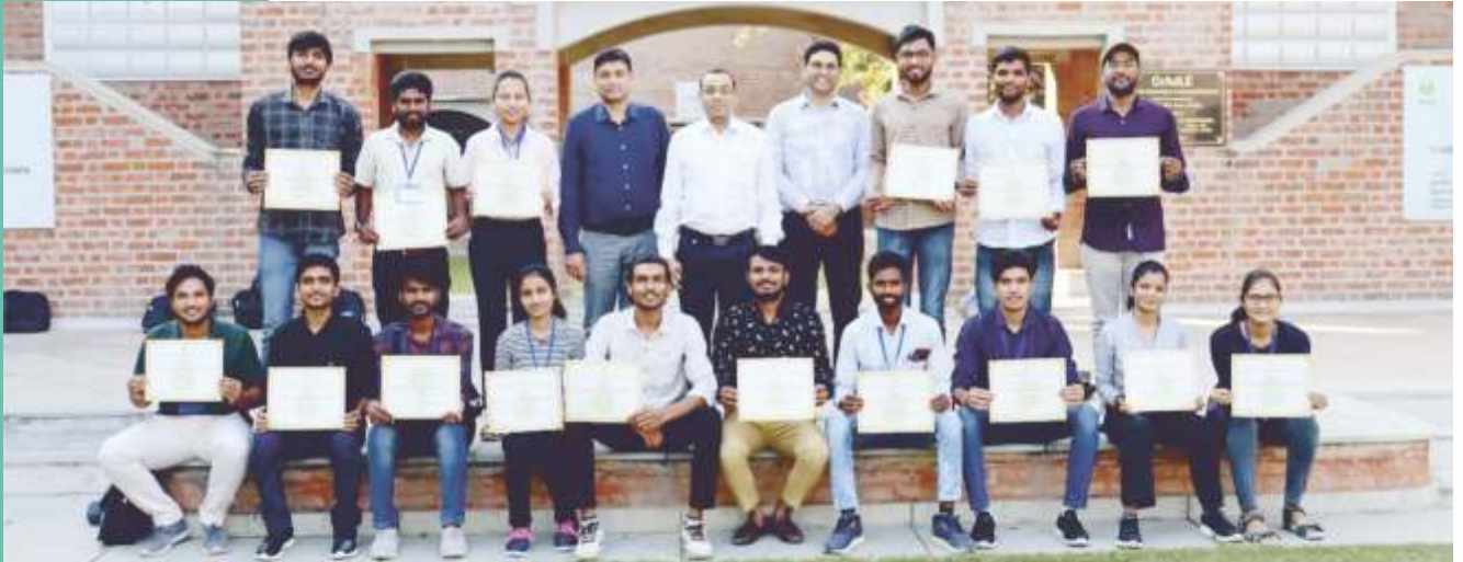
Participants of the 'Agro Based Entrepreneurship' Programme with the certificate of programme completion