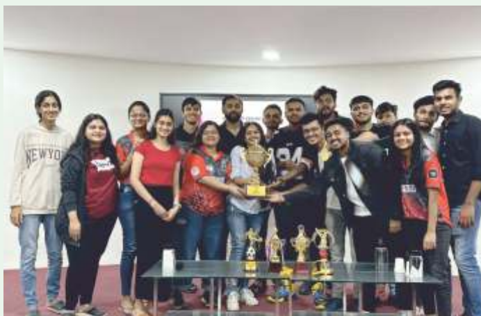
The winning team, Nawabis with the trophy

The EDII Sports Committee, with the assistance of the Institute, organised the EDII Premier League (EPL), an intercollegiate sports tournament, from November 17 to November 27, 2022. In the tournament, students compete to own one of four participating teams. Following that, a player auction takes place, and teams are formed. The tournaments included Cricket, Box Cricket (Male), Box Cricket Female, Football, Volleyball, Badminton, Table Tennis, Carom, and Chess are played.