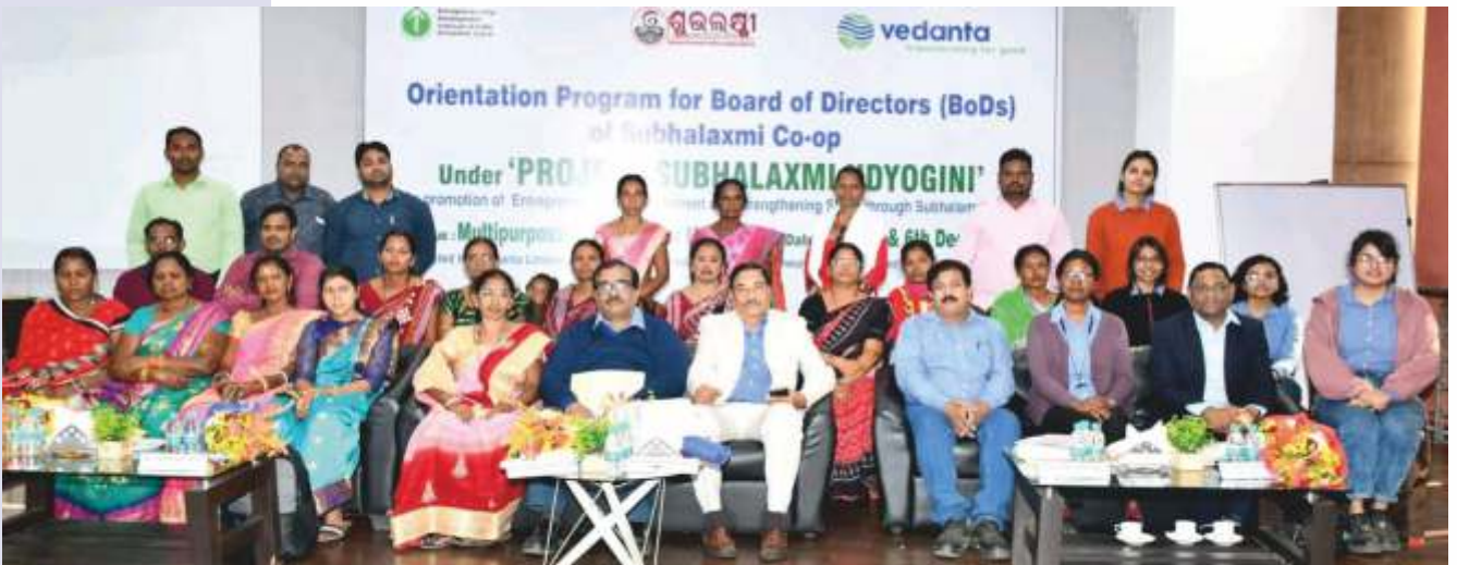
EDII Eastern Regional Office conducted an Orientation Programme for Board of Directors of Subhalaxmi Cooperative under Vedanta CSR project at Jharsuguda, Odisha on 5th - 6th Dec 2022.