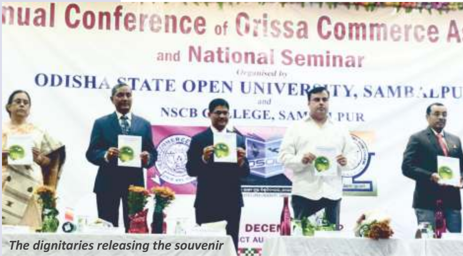
The dignitaries releasing the souvenir