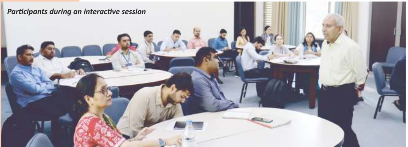
Participants during an interactive session

The programme equipped 21 faculty members with requisite skills, knowledge and competencies in the domain of entrepreneurship. They derived an understanding on the need and importance of entrepreneurship, various effective training methodologies to encourage and train students and techniques of preparing feasible & viable business plans. The faculty group also visited the industries of Concord Biotech Limited and Zytex Biotech Private Limited and several incubators, including Savli Technology & Business Incubator among many more. These visits were planned to give them a practical understanding of the classroom sessions.