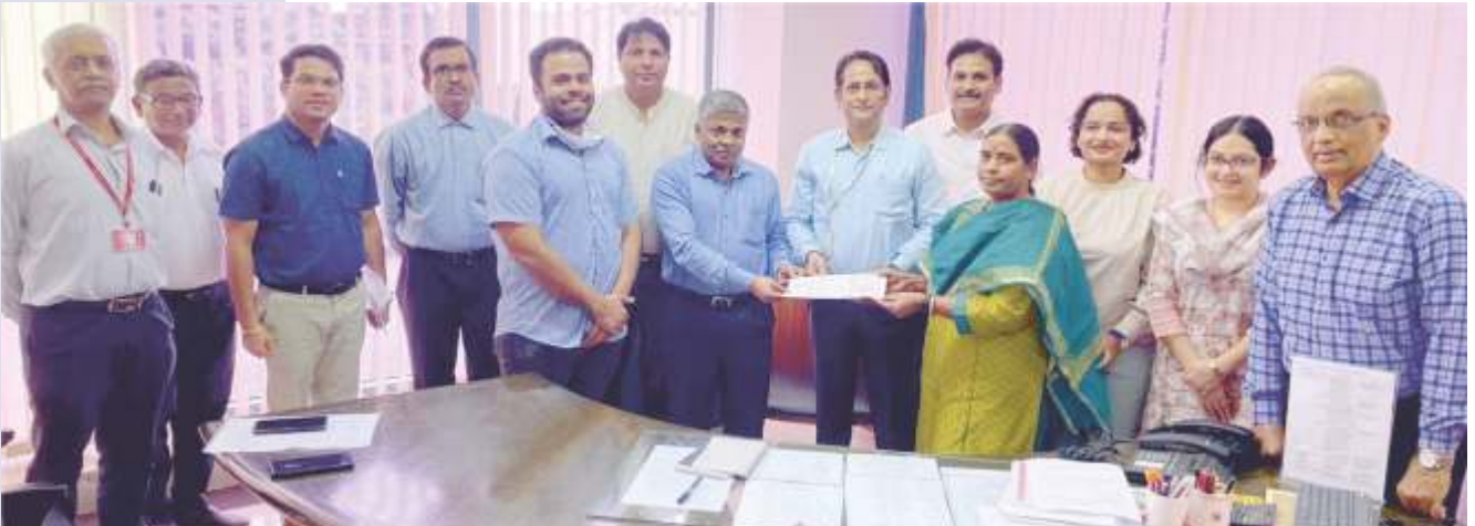
Meeting of SIDBI Team and PMC EDII with Government Officials of Goa during disbursement of funds under SCDF Scheme.