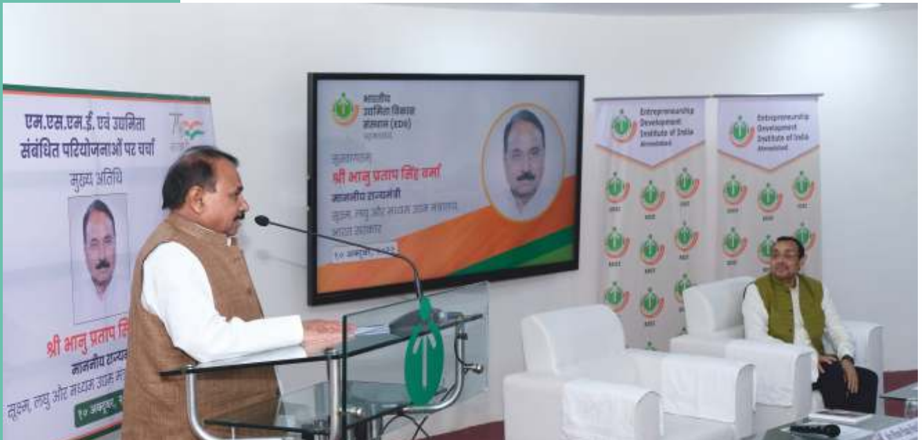
Hon'ble Shri Bhanu Pratap Singh Verma, Union Minister of State for Micro, Small and Medium Enterprises (MSME), Govt. of India during the interactive session on MSME & Entrepreneurship related projects.

Union Minister of State for Micro, Small and Medium Enterprises (MSME), Govt. of India visits EDII for deliberating on MSME and Entrepreneurship Related Projects