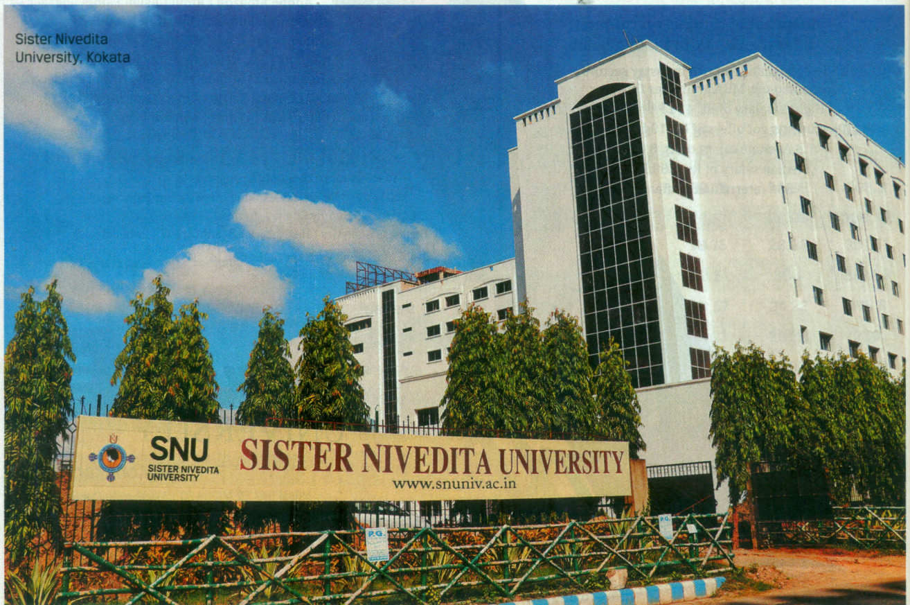
Sister Nivedita University, Kolkata