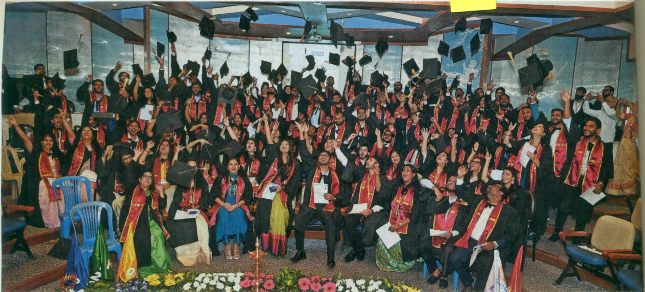
SIES College of Management Studies, Pune