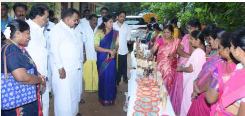
Micro Skillpreneurship Development Programmes (MSDP) on Dehydration of fruits and vegetables in Madurai. Hon'ble Member of Parliament Shri Manickam Tagore distributed the certificates to the participants.