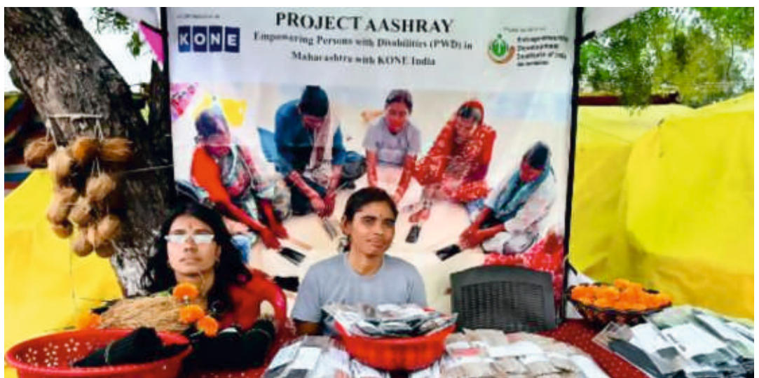
Women beneficiaries trained under MSDP in Pune seen with the products (Agarbatti) during an exhibition.

As a heartening outcome, entrepreneurs trained have initiated enterprises that are effectively meeting local needs of people for agarbatti, candles and diyas. Several trainees are in the process of setting up their enterprises.