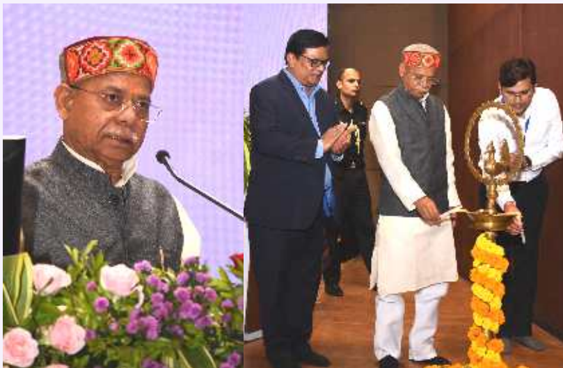
Distinguished Speaker, Shri Shiv Pratap Shukla Hon'ble Governor, Himachal Pradesh delivered Special Lecture on 'Amrit Kaal Ka Bharat.'