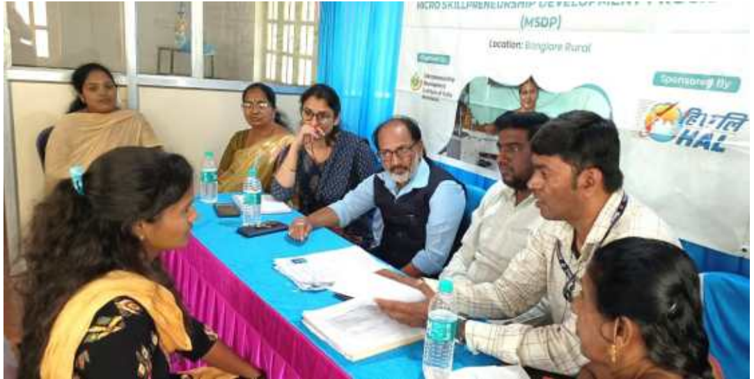
A prospective participant undergoing the selection process at Nelamangala in Bangalore.