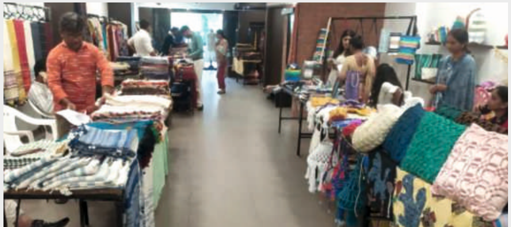
Artisans participated in Beyond Gallery Exhibition held at Ahmedabad.

Project Aarohan aims to empower farmers, fisherfolk, women and artisans of Mundra by improving their livelihood through poverty reduction programmes and promoting & ensuring inclusive and sustainable economic growth for existing enterprises. This Project focuses on capacity building programmes through skill-based Entrepreneurship Development Programmes and Enterprise Creation Activities. EDII as the implementing partner trained 180 communities from Mundra through Micro Skillpreneurship Development Programmes (MSDP) for a year and offered handholding for six months. Over the last three months, in addition to participants of Mota Bhadiya village being mobilized, EDII initiated the process for artisan card application for 22 artisans with the District Industries Centre. The artisan card would help artisans avail benefits of government schemes and provide them accessibility to participate in Government exhibitions. To increase the reach of artisans to the customers, a product catalogue was readied and the artisans were handheld to establish market linkages.