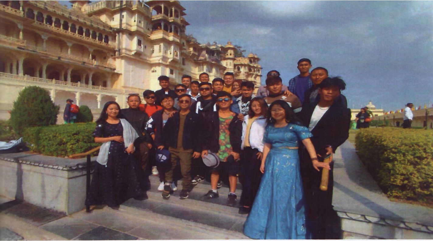
Participants group photo at City Palace during Study Tour to Udaipur