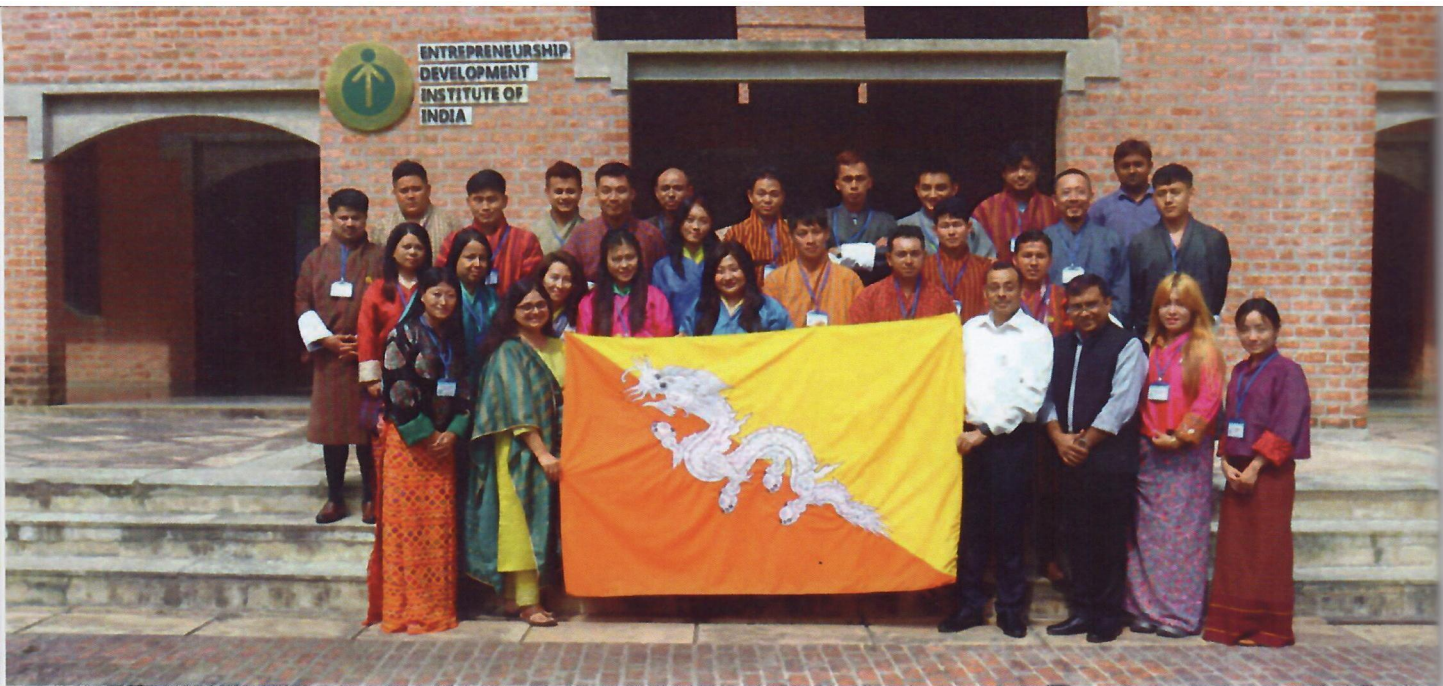
Participants group photo with Bhutan Flag (alongwith Director General, Course Director and ITEC Programme Coordinator)