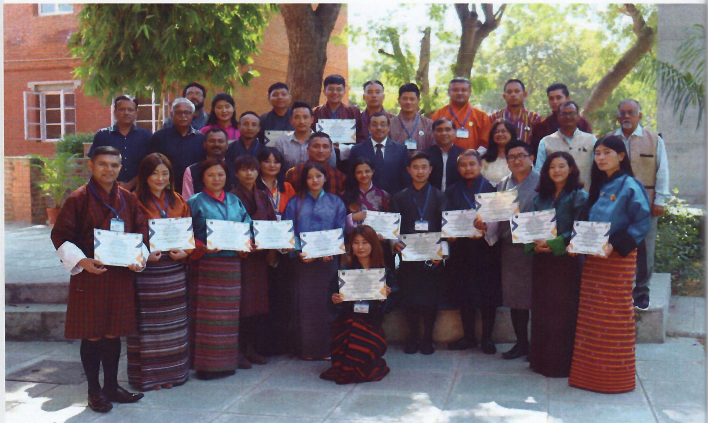
Participants after completion of Valedictory Ceremony