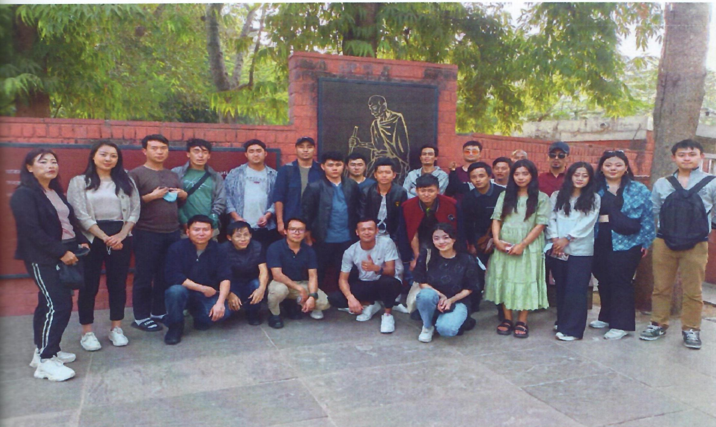
Participants during their visit to Gandhi Ashram, Ahmedabad