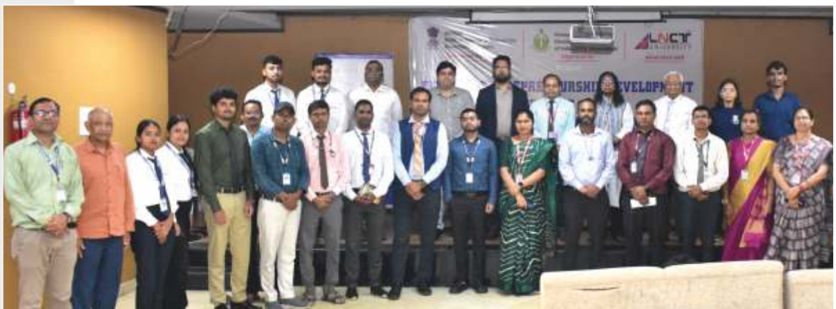
Faculty Development Programme at Bhopal, Madhya Pradesh.

To develop a professional cadre of faculty in S&T entrepreneurship, a two-week Faculty Development Programme (FDP) was organized at LNCT University, Bhopal. 30 faculty members from nine S&T institutions participated in the programmes. The programme gave the a dynamic learning experience and equipped them with necessary skills to foster entrepreneurship within their academic settings.