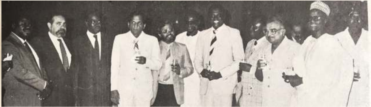
EDII team with the organisers and some of the participants of the Inter Regional Workshop on Entrepreneurship Development held at Abidjan for the francophone countries of Africa.

INTER-REGIONAL WORKSHOP ON ENTREPRENEURSHIP DEVELOPMENT FOR FRENCH-SPEAKING AFRICAN COUNTRIES HELD IN ABIDJAN