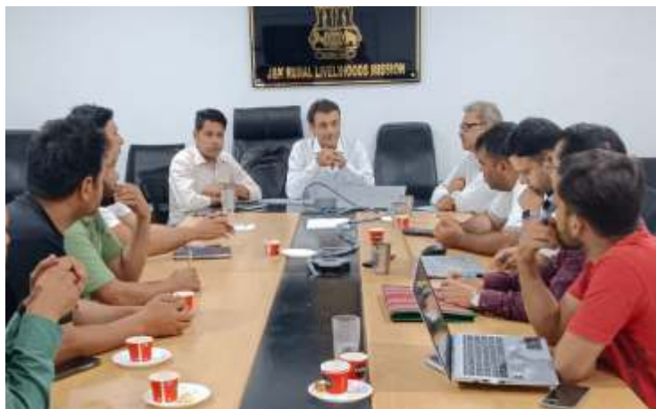
A one-day orientation workshop was organized for Jammu and Kashmir Rural Livelihood Mission (JKRLM) Officials on SVEP Implementation, on 1st July 2024 in the J & K block.