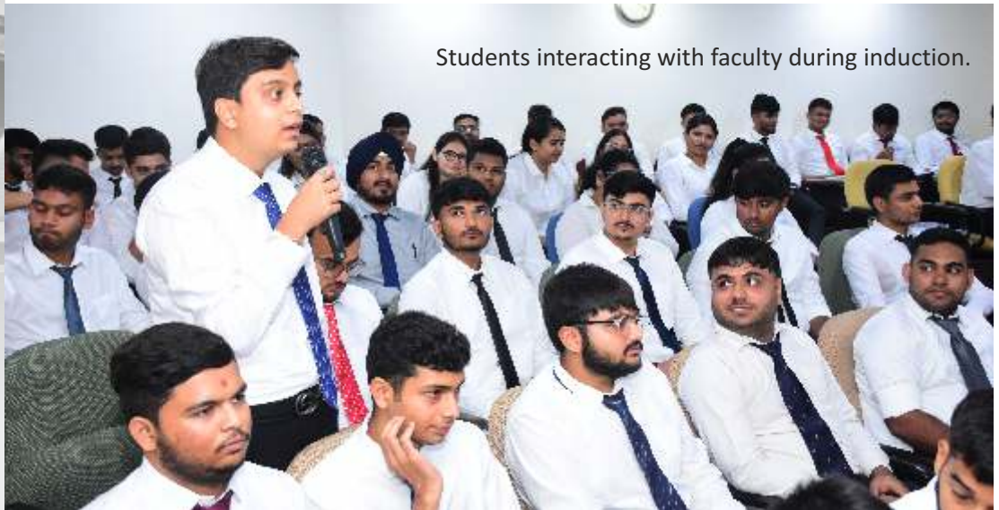
Students interacting with faculty during induction.

85 students represent varied backgrounds with 13 holding technical degrees; 64 representing Commerce, Finance & Management domains and 8 holding degrees in Humanities.