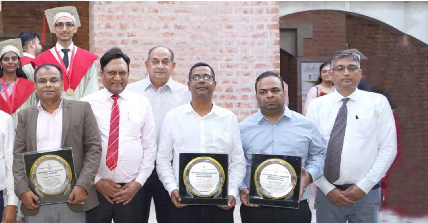
Award winners with distinguished dignitaries.