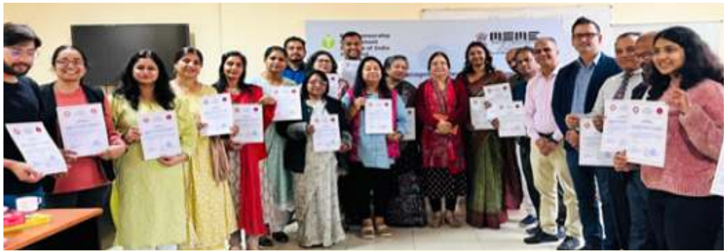
Participants of 1-week Advanced – MDP on Supply Chain Management conducted by EDII Ahmedabad under ESDP scheme of Ministry of MSME, Govt. of India, at Dehradun, Uttarakhand receiving the completion certificates.