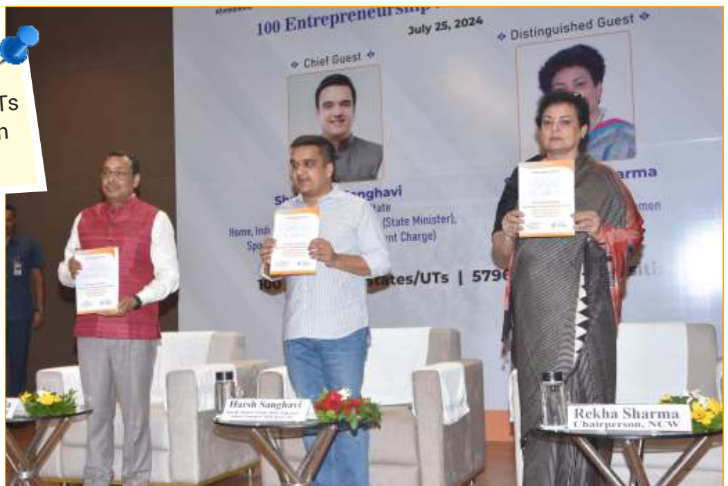
Project Completion Report being released on the occasion.