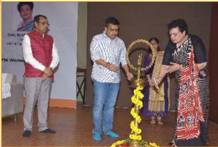
Dignitaries lighting the ceremonial lamp.