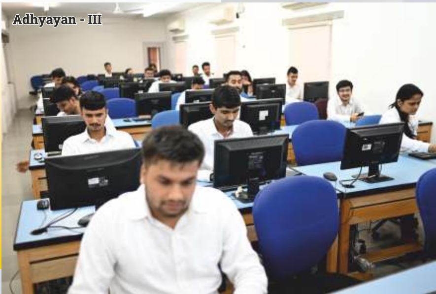
Adhyayan - III