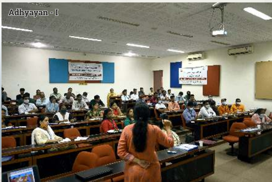
Adhyayan - I