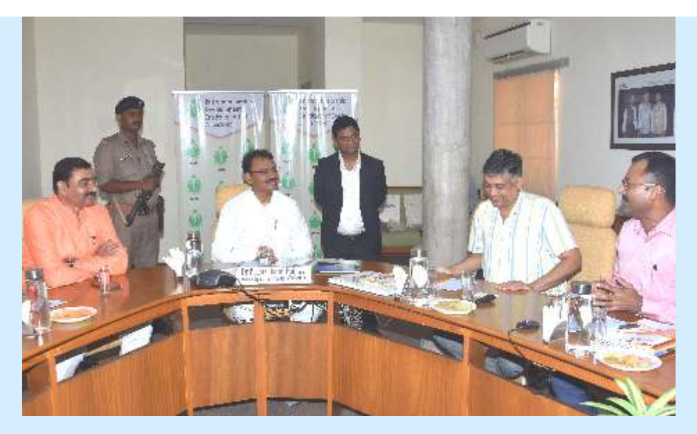
September 20, 2024: Dr. Prem Chand Bairwa, Hon'ble Deputy Chief Minister of Rajasthan, visited EDII to explore collaboration opportunities with the institute. The discussion focused on how EDII can support the promotion of an entrepreneurial ecosystem in Rajasthan.

August 6 2024: MoU was signed with Bajaj Finserv Ltd. to launch Project Saksham. The project aims at enhancing the financial capabilities, knowledge, and opportunities of rural and semi-urban small enterprises and Farmer Producer Organizations (FPOs) for economic and sustainable growth.