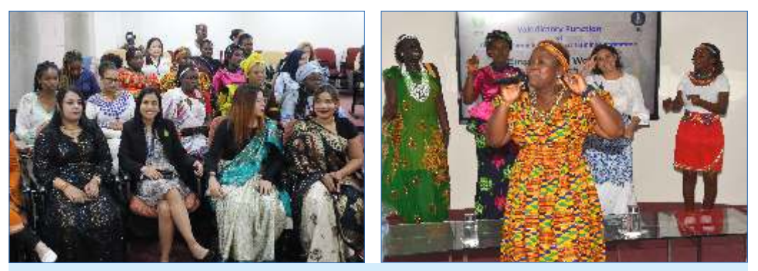
Participants of the programme - 'Empowering Women Through Entrepreneurship Development' during classroom sessions.

Focus was retained on enhancing their entrepreneurial capabilities. The objectives were to disseminate knowledge on tools and techniques that may facilitate the growth of women-owned businesses. The participants leant about business opportunities and preparation of viable business plans, managerial qualities, soft skills and various avenues that could be tapped on their entrepreneurial journey.