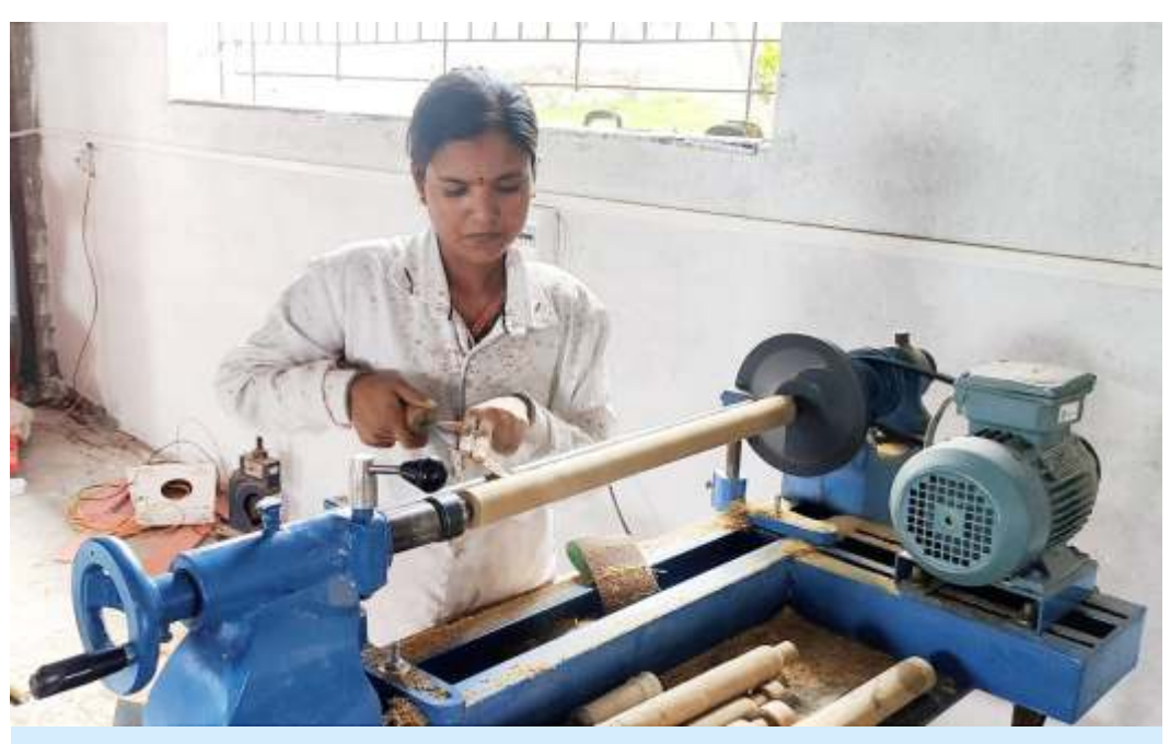
Processing of Bamboo products under Latur Cluster.

Two craft cluster projects were sanctioned wherein EDII will function as Technical Support Agency. These clusters include - Dausa Cluster (Jutti) in Rajasthan and the Latur Cluster (Bamboo) in Maharashtra. With the inclusion of these two new clusters, EDII's presence now extends to six craft clusters under the Programme.