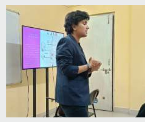
Technology-Based Entrepreneurship Development Programme (TEDP) at Vapi in Gujarat under Department of Science & Technology (DST), Govt. of India.

Till now, the Institute has completed five programmes, including two Technology Entrepreneurship Development Programmes, training 60 youths; two Women Entrepreneurship Development Programmes (WEDPs) equipping 65 women entrepreneurs; and a Faculty Development Programmes (FDP), creating a cadre of 30 faculty mentors.