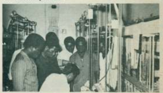
Participants from the Francophone countries during one of the factory visits.

During the Visits to Small and Medium Enterprises, the participants from all the 3 countries expressed desire to get technical assistance from some of the units that they visited for setting up similar units in their country. Considering such interest, the participants were provided with project profiles of some of the selected products