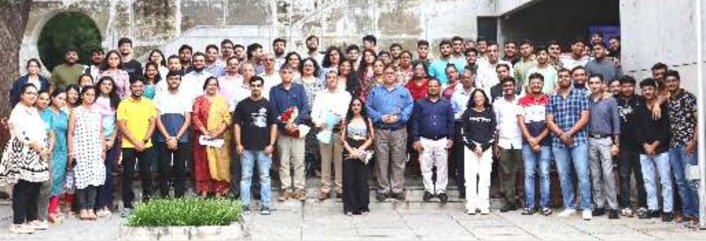
Teachers' Day celebration and launch of website of SEED (Society for Entrepreneurial Education), the Eclub.