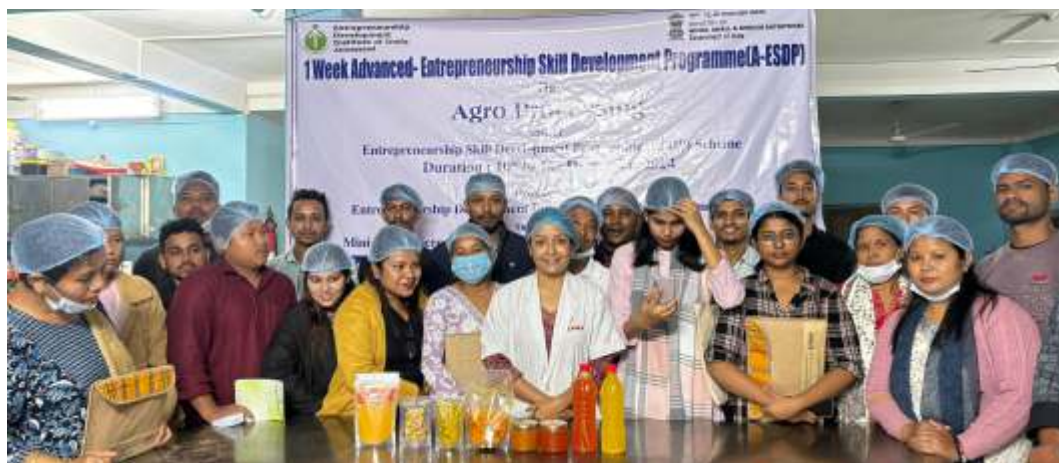
Participants of Advanced - Entrepreneurship Skill Development Programme.

Northeast India represents a treasure trove of entrepreneurial possibilities waiting to be explored. By leveraging opportunities, existing and potential entrepreneurs stand bright chances of not just a bright entrepreneurial career but also of making a contribution to the growth and prosperity of the region.