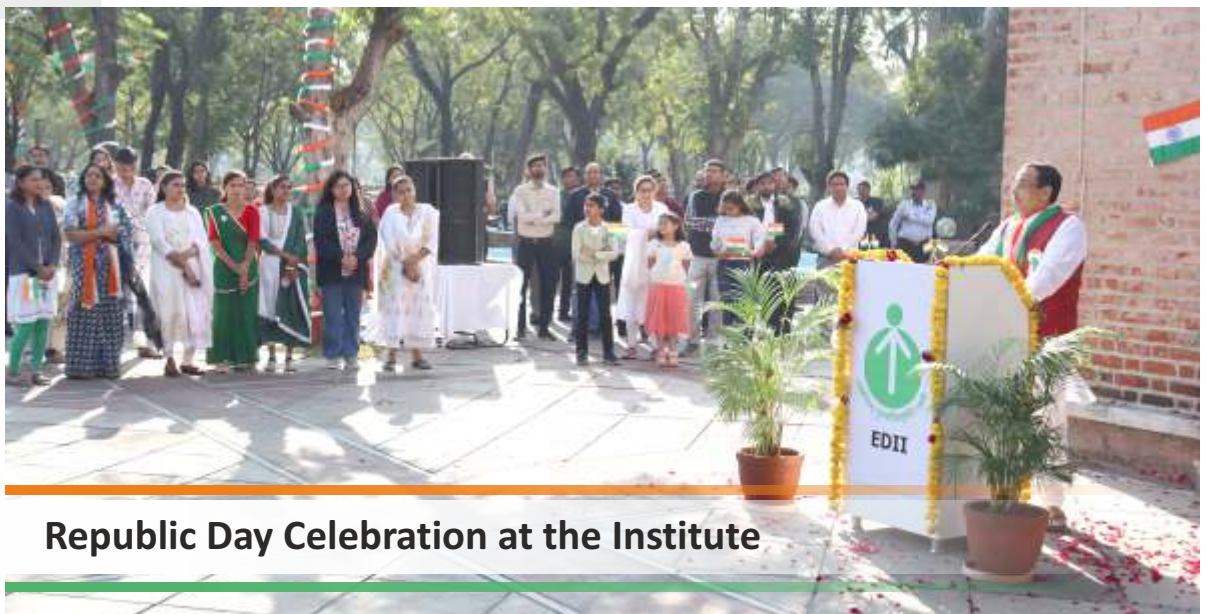
Republic Day Celebration at the Institute