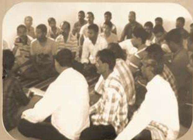
Sensitising the youths of Balinali

While development plans need to be put in place, it is also important to ensure that the vulnerable groups are suitably compensated through a rewarding resettlement plan. TATA Sponge Iron Ltd. (TSIL), a joint