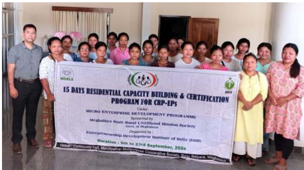
CRP-EPs of 15 Days Residential Capacity Building & Certification Programme.

With abundance of natural resources such as rivers, sunlight and biomass, Northeast India holds significance in the renewable energy sector. Entrepreneurs can explore ventures in solar power generation, and biomass energy production to meet local energy sustainably.