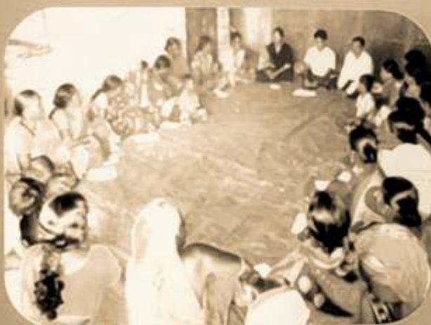
Training Programme at Gopinathpur

The uniqueness of the project lies in bringing 'rehabilitation and resettlement plans' and 'CSR initiatives' under one umbrella for holistic and sustainable development. The project commenced from June 2013 and has already recorded notable milestones.