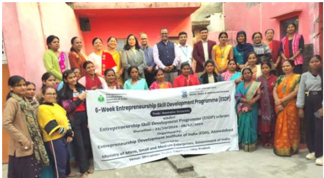
Participants of Entrepreneurship Skill Development Programme at Dharampur Tiraha, Gorakhpur, Uttar Pradesh.

180 individuals were trained under these programmes in Gorakhpur and Azamgarh. Under the guidance of EDII mentors, most of the trained youths, identified small business opportunities and are pacing towards establishing sustainable businesses under the handholding support of EDII mentors.