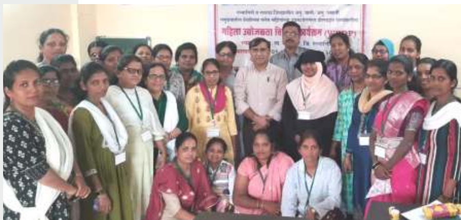
Participants of Women Entrepreneurship Development Programme at Devrukh under UDAYA Project.

Several projects, being implemented by EDII are aimed at empowering rural women, Persons with Disabilities and other disadvantaged groups. Project Sankalp , supported by Standard Chartered Bank focuses on rural women in Karnataka and Tamil Nadu and trains them through customised skill-based entrepreneurship development workshops. In last two months of December and January, five Micro Skillpreneurship Development Programmes were held in various district of Tamil Nadu and Karnataka. Till now, under this programme, 640 women have been trained and 114 micro and small enterprises have been set up.