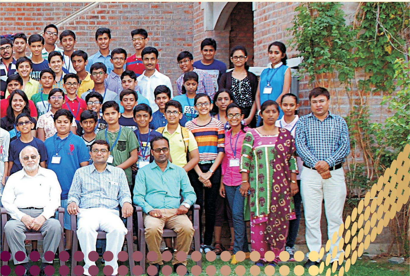
Participants of the 27th Summer Camp on Entrepreneurial Stimulation for Children seen with EDII faculty members