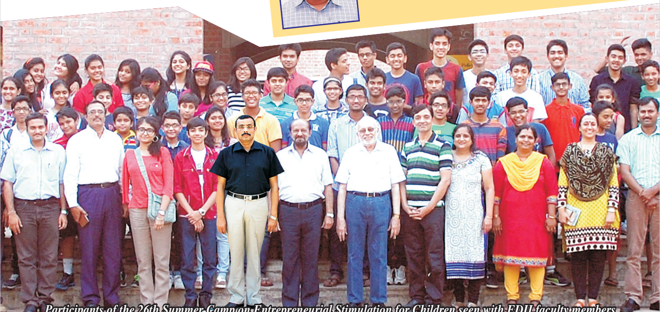
Participants of the 26th Summer-Camp on Entrepreneurial Stimulation for Children seen with EDII faculty members