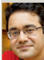
Kunal Bahl cofounder, Snapdeal