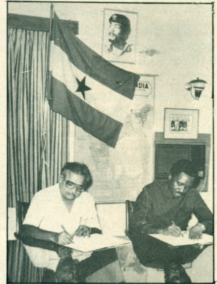
His Excellency, the High Commissioner of the Republic of Ghana in India and the Director EDI-I signing contract for initiating EDP activities in Ghana (detailed report on page 8)

Our programmes from September onwards are expected to be held on the campus. We hope there will be fewer teething troubles to get used to the new environment somewhat away from the city.