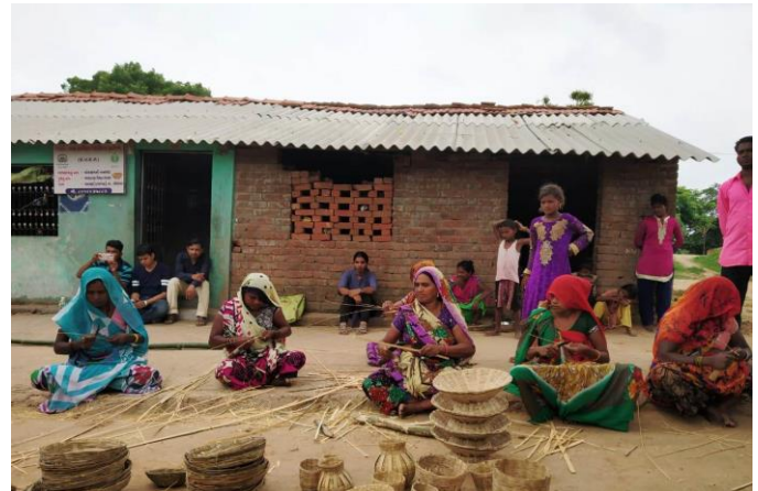
Women Entrepreneurs are making Bamboo Products

viable. After SVEP intervention the business had restarted in July, 2017 with only decorative Pooja thali.