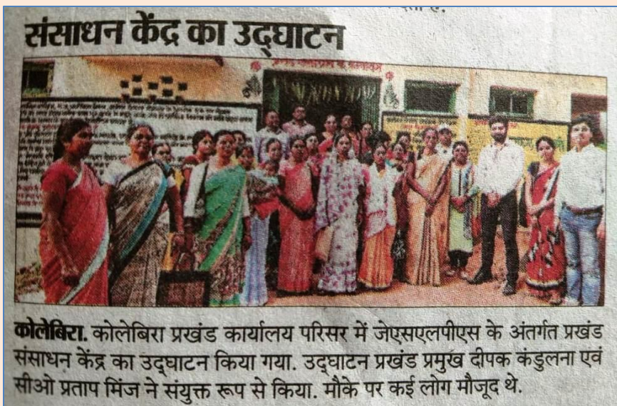
New BRC Office inauguration at Kolibera Block, District Simdega