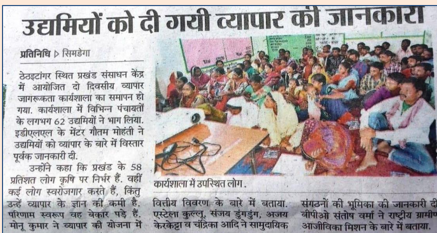
Entrepreneurs Development Programme at Thetaitangar, District Simdega