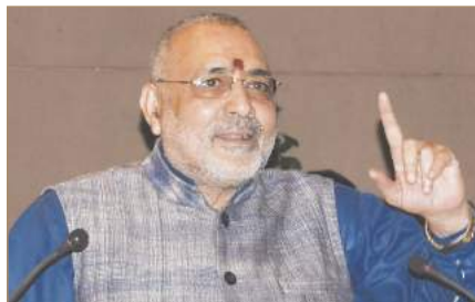
Hon'ble Union Minister of State (Independent Charge) for Medium, Small and Micro Enterprises, Shri Giriraj Singh, addressing the audience during the inaugural function.

The MSME Research Block was inaugurated by Hon'ble Shri Giriraj Singh, Union Minister of State (Independent Charge) for Medium, Small and Micro Enterprises at EDII. Addressing the gathering, the Hon'ble Minister