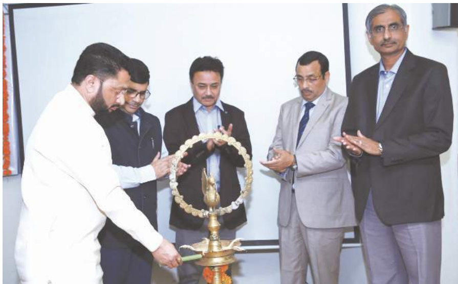
Dignitaries lighting the ceremonial lamp at the inauguration ceremony.