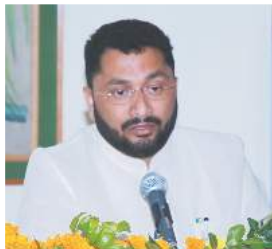
Shri Ishwarbhai Parmar, Hon'ble Minister addressing the gathering

The Chief Guest Hon'ble Minister of Social Justice and Empowerment, Gujarat State, Shri Ishwarbhai Parmar beckoned all to take advantage of learning and setting up own enterprises. The Chief Guest congratulated the participants for having chosen to get trained. He said, "Skills are the biggest assets one can possess and it is heartening to note that we are now giving it the importance that it deserves. Your skills will make you indispensable and you will be one of the important individuals to steer growth in this industrialized state of Gujarat. While the