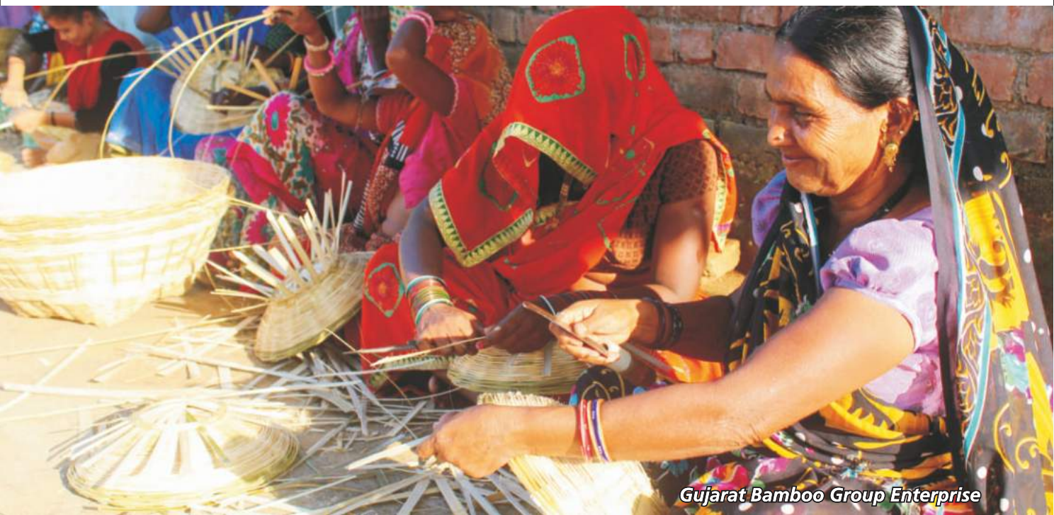
Gujarat Bamboo Group Enterprise