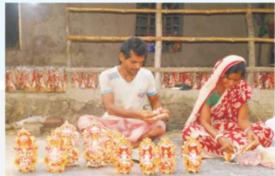
Shyamali Idol Making enterprise in West Bengal

Till date, 29,321 enterprises have been promoted and Rs. 80.85 Crores have been disbursed. Also, 1069 enterprises have been provided with loans worth Rs. 4 Crores via various financial organisations. Under Udyog Aadhar, 6486 SVEP enterprises have been registered which would help the entrepreneurs receive a host of benefits, including credit linkages, ease in licensing and applicable concessions/subsidy. During October to December 2019, 4050 Entrepreneurs have been trained under the programme.