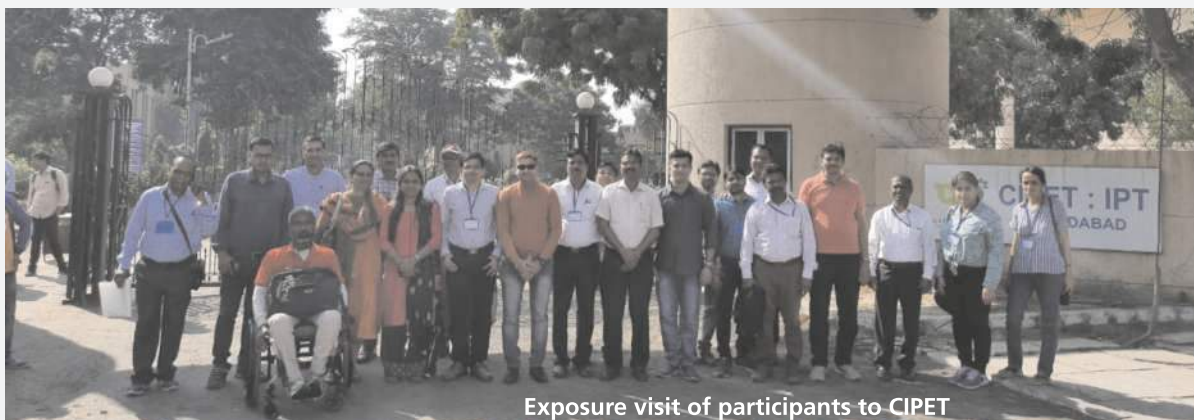
Exposure visit of participants to CIPET

This 16th programme in the series, sponsored by Department of Science & Technology (DST), Govt. of India, was organized during 2-13 December,