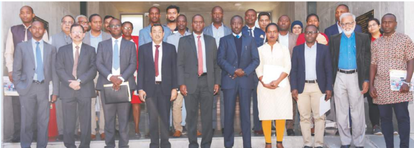
Dignitaries and participants seen at the valedictory programme

Trainers' Programme was conducted at EDII Campus during 4 November to 27 December, 2019. The programme was attended by 15 participants (Director, faculty and trainers of the Centre) who will be functioning as resource persons at Rwanda Centre. The participants had interactive classroom sessions with the aim to gain knowledge on various facets of entrepreneurship. The participants were given brief on various EDII models; like EDII –EDP Model, Growth Programme, Cluster Development Programme, Family Business Management Programme, Performance Improvement Programme and several other development models so that they could learn from Indian experiences and test the replicability of these models in Rwanda. They also learnt about the broad entrepreneurial ecosystem, business plan preparation, business opportunity identification, marketing & networking; thematic training programmes on entrepreneurship and promoting entrepreneurship through outreach activities. Participants presented their action plan at the end of the programme to explain their vision about the Centre activities. The curriculum of the programme equipped the participants with the skills to analyse competency of budding entrepreneurs, design a training intervention and administer the training.