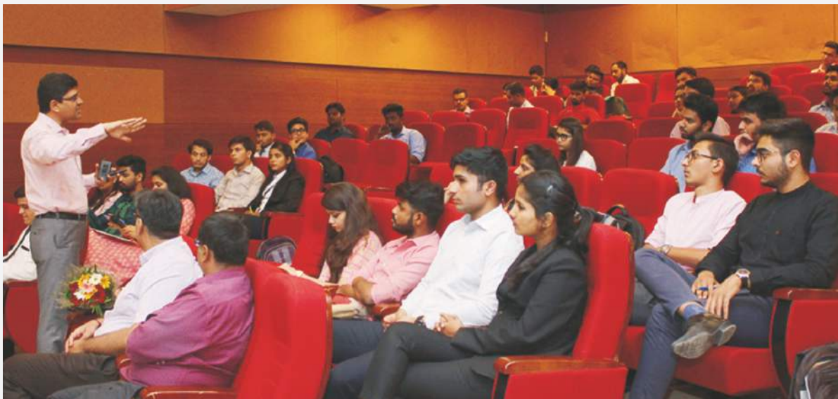
Awareness Programme at National Institute of Food Technology Entrepreneurship and Management (NIFTEM)