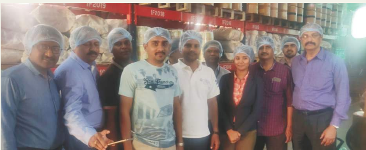
FDP participants on an exposure visit

The programme was well received with each participant formulating an action plan for propagating the knowledge received among the students. The participants claimed to have had an insightful experience. They felt that the program helped them gain knowledge and tremendous confidence and motivation in conceptualizing, planning and executing activities related to entrepreneurship.