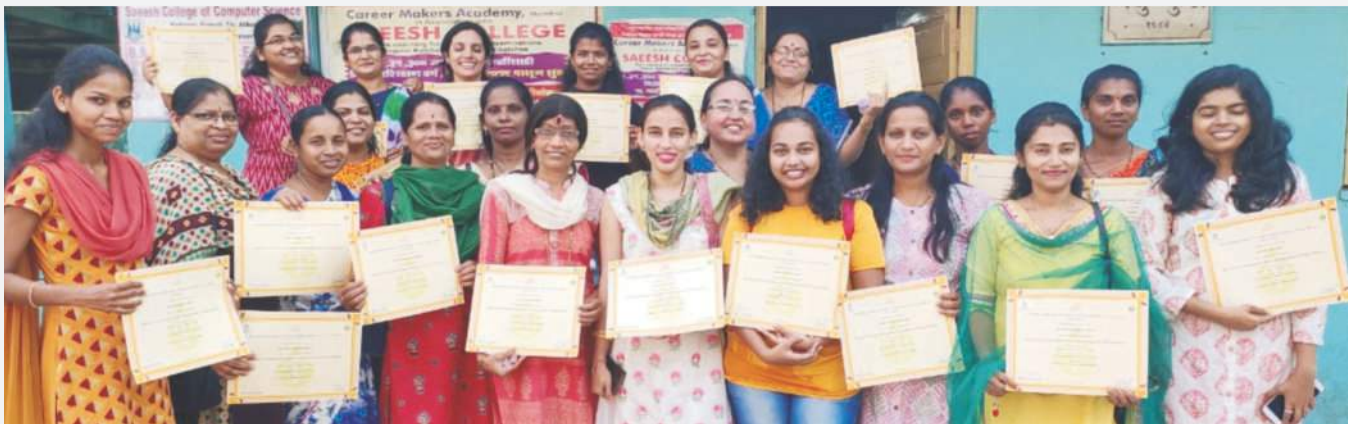
Participants awarded certificates after the completion of training

EDII joined hands with TATA Communications Ltd. in 'Project Udaya' to promote entrepreneurship among women from SC/ST, weaker sections and SHG members for sustainable income generation through enterprise creation. The project was launched on June 4, 2019 at Alibaug, Raigarh district of Maharashtra with an aim to develop entrepreneurial capabilities among potential women entrepreneurs; strengthen their knowledge, skills and behavioural attributes to initiate, plan and implement entrepreneurship development activities effectively. During the