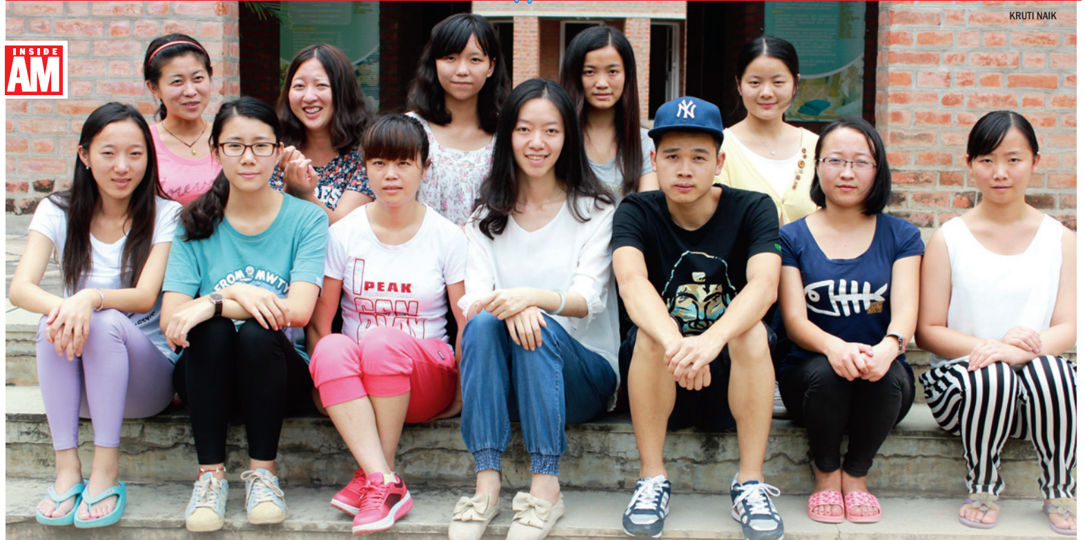
These students speak fluent Hindi and have enrolled for a nine-month course at EDI. Seated in the centre is their instructor. Bollywood films are also part of their course

NI HAQ TQ NANAQ TQ NANAQ TQ Eleven BA Hindi students from China's Yunnan Minzu University