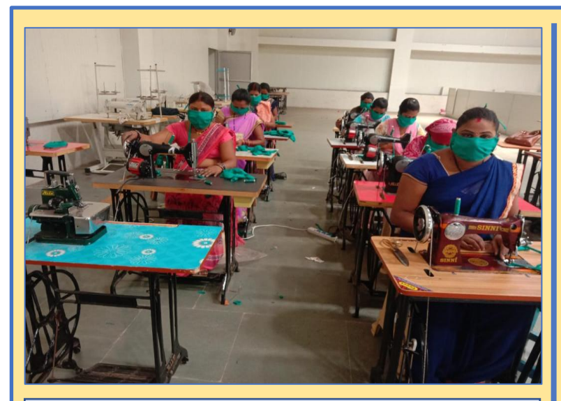
Mask Making Unit: Group Enterprise, Kurud, Chhattisgarh