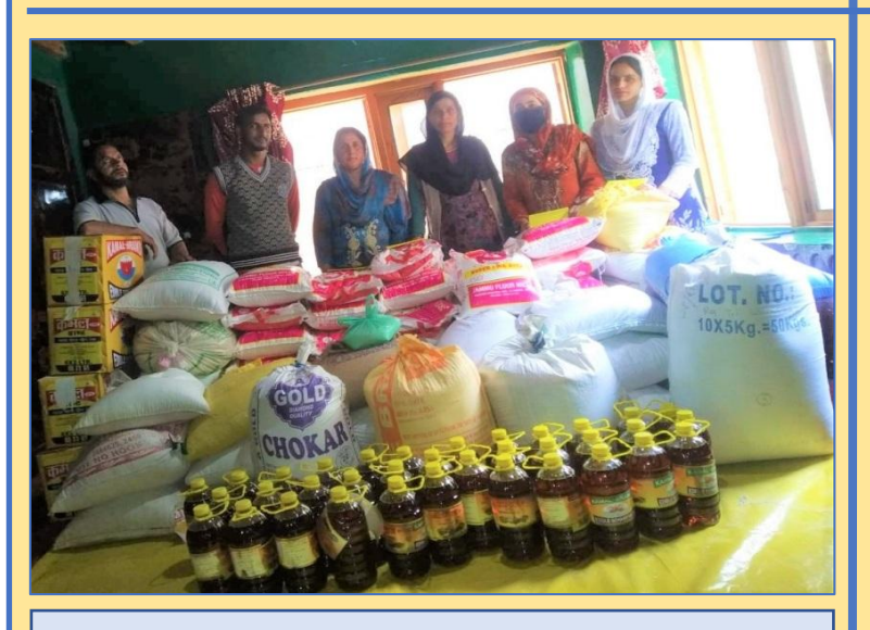
Distribution of "Essential Kit" to families by BRC, Lar, J&K