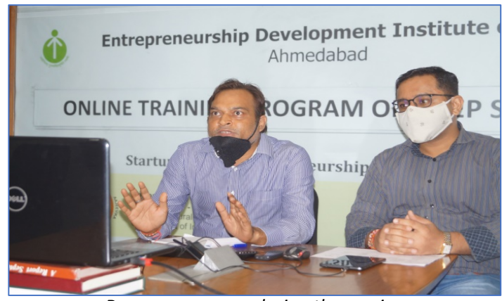
Resource persons during the session

20 participants from Andhra Pradesh, Bihar, Jharkhand, Madhya Pradesh, Odisha, Rajasthan and West Bengal participated in this Online training programme. The participants were made familiar with each feature of the SVEP web and mobile app. Practice sessions and an online test for the participants were also conducted as a part of this training programme.