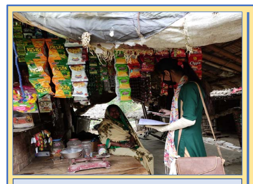
Enterprise Census being undertaken in Bankati block, Uttar Pradesh