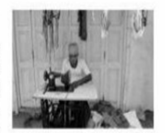
A tailor sews facemasks at a roadside stall during lockdown, in Siliguri on Monday.

These micro enterprises have been trained by Ahmedabad-based Entrepreneurship Development Institute of India (EDII) under the Start-up Village Entrepreneurship Programme (SVEP), a subscheme of National Rural Livelihood Mission (NRLM) of the Union Ministry of Rural