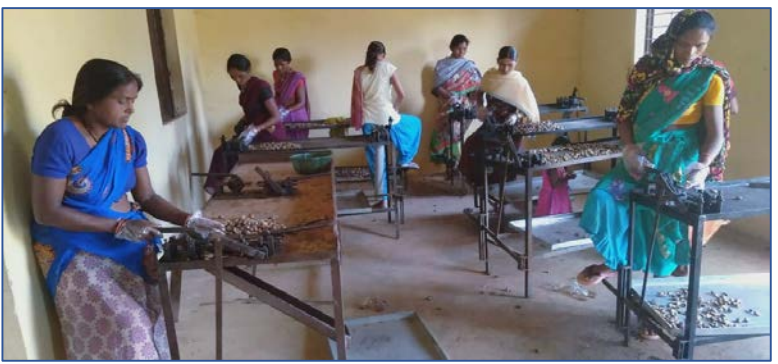
A cashew processing unit at Bastar

The amount of the CEF loan was majorly utilized for the repair and maintenance of the machinery equipment required to process cashew nuts. Along with this, 15 quintal of raw cashew nuts were collected with the help of SHG members to make the unit operational at the earliest. The unit began to operate in October 2018. The unit sells raw, full, half and four quart cashew nuts in the market and gradually the income has increased to Rs. 90,000 to Rs 1,00,000 per month. The profit, distributed among the entrepreneurs, has improved their lifestyle and in turn their social values.