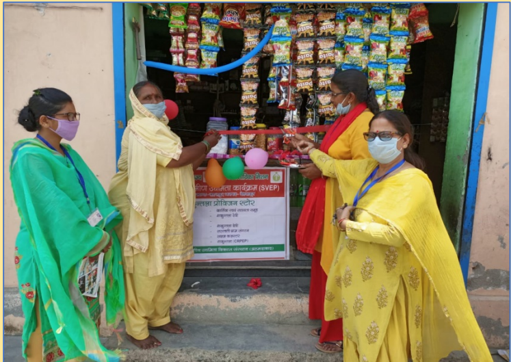
Enterprise promotion activities resume in Sahaspur, Uttarakhand