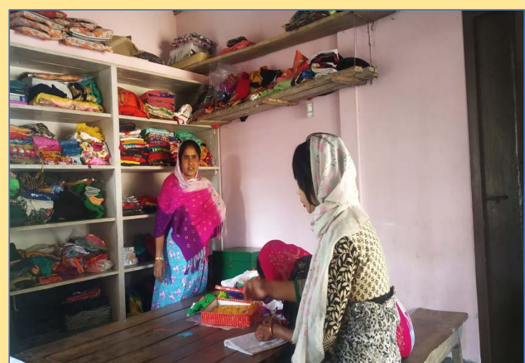
Preparation of Performance Improvement Plan initiated in Sidli-Chirang, Assam