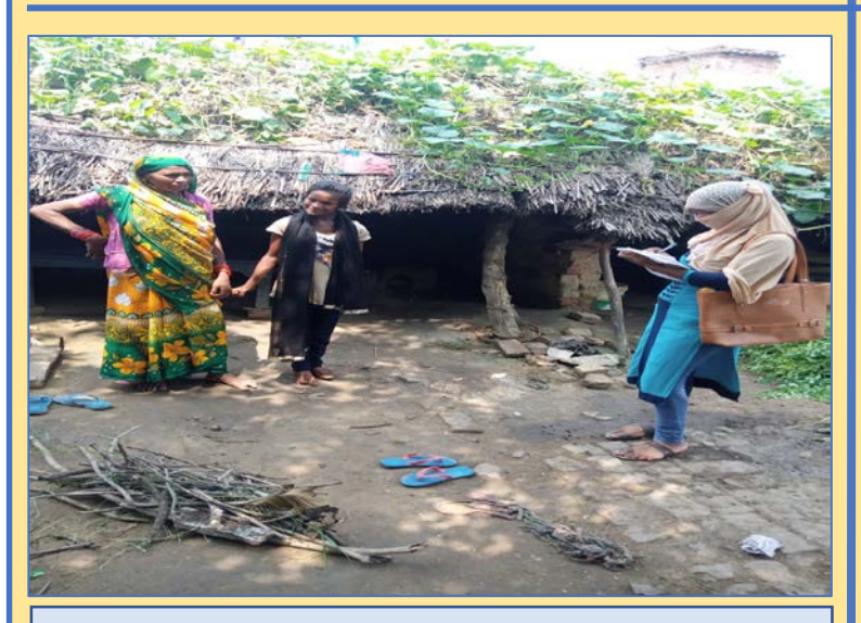
Household survey being conducted in Pipraich block, Uttar Pradesh