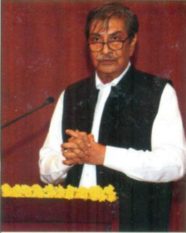
SHRI PRABHATH KUMAR

Former Cabinet Secretary & Former First Governor of Jharkhand