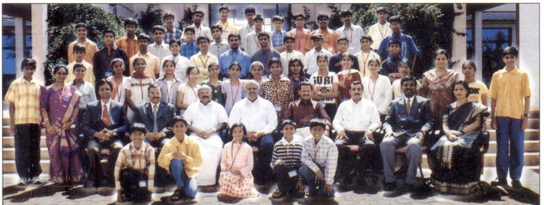
The Institute recently conducted a Winter Camp for Children in association with the Jansons School of Business, Coimbatore.