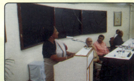
Padmashree Dr. Kumudini Lakhia, the renowned danseuse, addressing the participants.