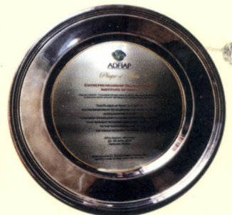
ADFIAP Development Award for Local Economic Development 2014

Ranked one of the top four B-Schools for Entrepreneurship in India [as per the magazine 'Entrepreneur' Jul. '11-Vol.2-Issue 11]