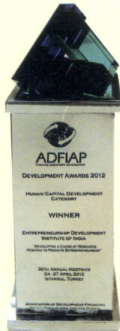
ADFIAP Development Award for Human Capital Development 2012