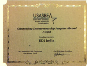
United States Association for Small Business and Entrepreneurship (USASBE) Outstanding Entrepreneurship Program Abroad Award