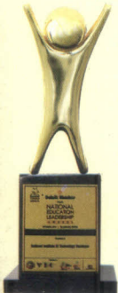
Dainik Bhaskar National Education Leadership Awards 2013