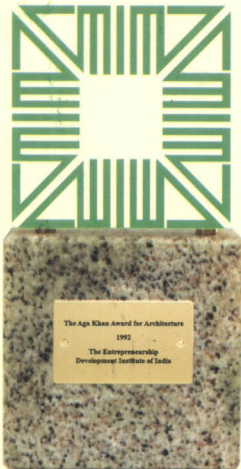
The Aga Khan Award for Architecture 1992