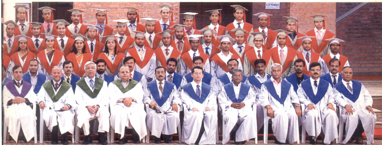
ocation Chief Guest, EDI Governing Body Members during the Convocation ceremony organised on EDI campus on 27 June 2008