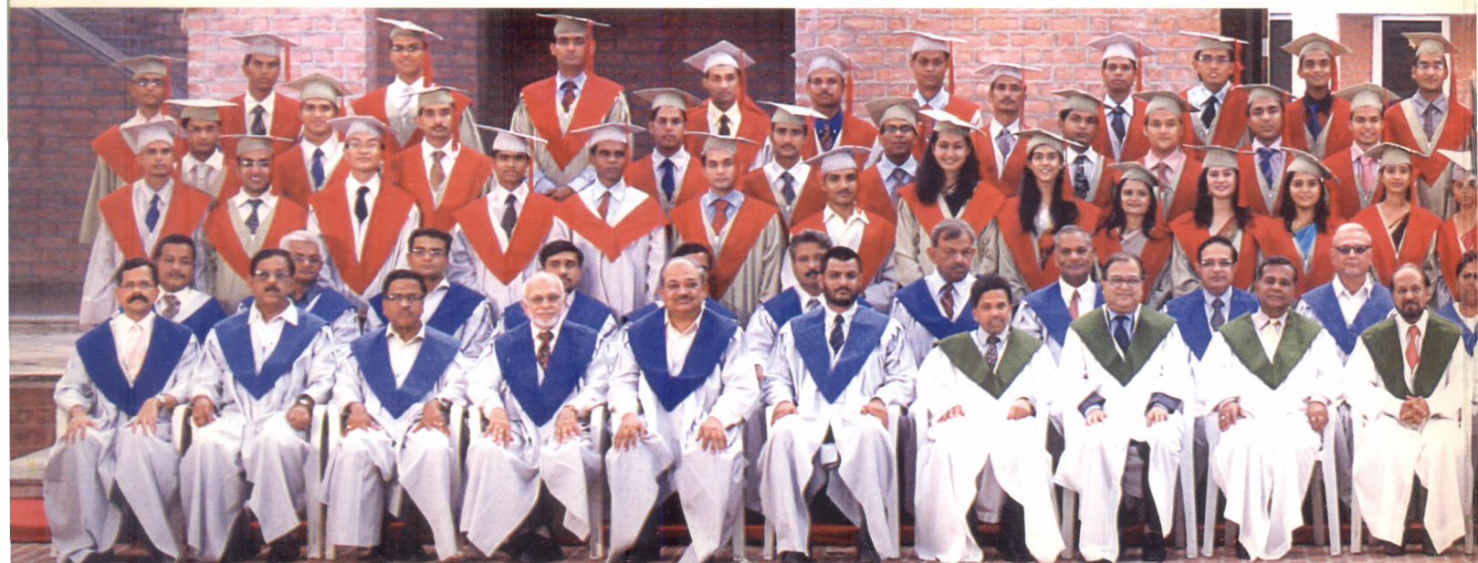
10th batch students of EDI-PGPs seen with Shri Venugopal N. Dhoot, Chairman & Managing Director, Videocon Group and the Con.