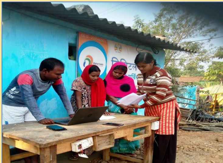
EDP for potential entrepreneurs of Lalbarra Block of Madhya Pradesh