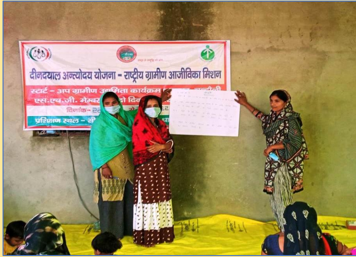
Regular PTS data Collection by CRP-EPs in Bolpur, West Bengal