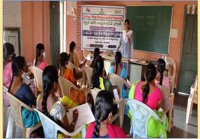
CRP-EP Training Conducted in Chinnakodur Block of Telangana