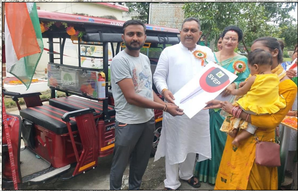
Highlight from the 76 th Independence Day Celebration in Sahaspur block of Uttarakhand: The Honorable Chief Guest, MLA Sahadev Pundir Ji, inaugurated an E-rickshaw of SVEP supported entrepreneur and felicitated SVEP team during the event.