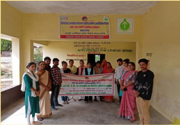
CRP-EP training conducted at Kadaura Block, Uttar Pradesh.