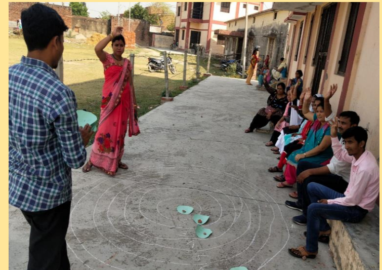
Training imparted to entrepreneurs on EDP module in Jashpur block, Chhattisgarh