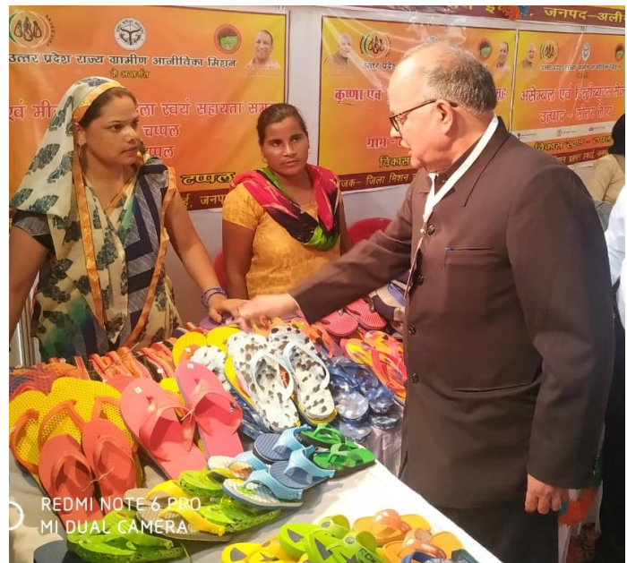
Guests intrigued by the Footwear collection

“We would like to expand the business even further in terms of production volume and profits generated. The EDP training has helped us immensely. It has taught us the key elements of business. The records pertaining to daily production, purchases, stock inventory and the sell amounts are properly kept and discussed amongst us. We are really grateful to SVEP for all our achievements”.