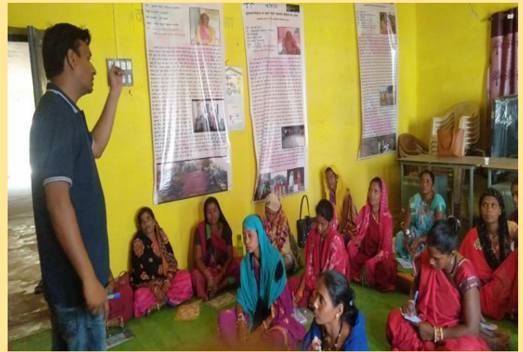
Refresher Training of CLF Members at Bijadandi, Madhya Pradesh