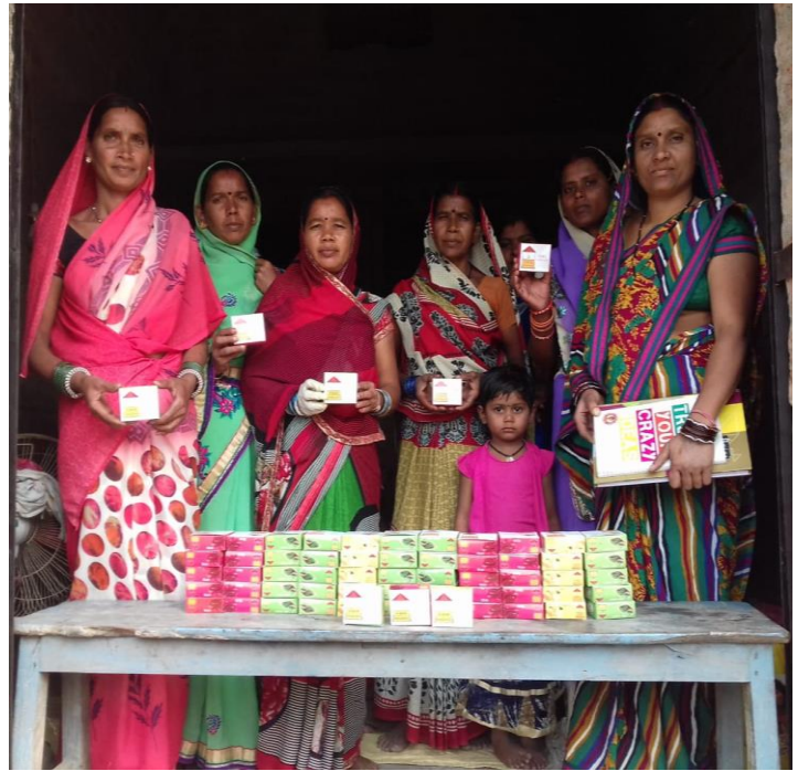
An SVEP group enterprise making a variety of handmade soaps.

The business plan got approved by BRC and they got a funding of Rs. 80,000 under the project. Their products were displayed during the Aajeevika Divas where they earned Rs. 12000 from the exhibition and received appreciation & motivation from various District & State Government Officials. The women participated in several exhibitions and successfully supplied their products in various government programmes