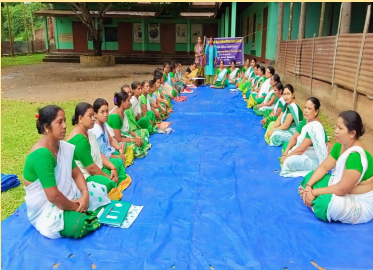
Discussion With Entrepreneurs Regarding Business Proposals at Hajo Block, Assam