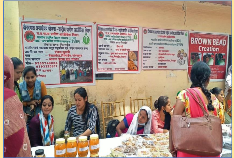
SVEP Entrepreneurs of Pipraich Block, UP participated in Swasthya Mela at Gorakhpur, UP