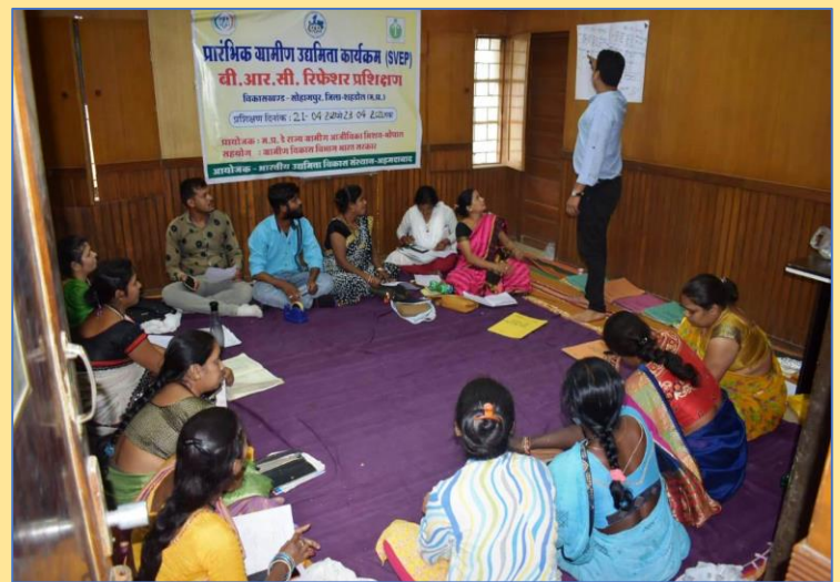
Refresher Training of BRC Members of Sohagpur, Madhya Pradesh