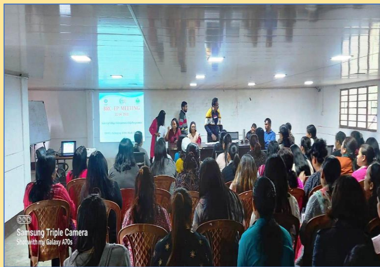
BRC Members Meeting at Kalimpong, West Bengal