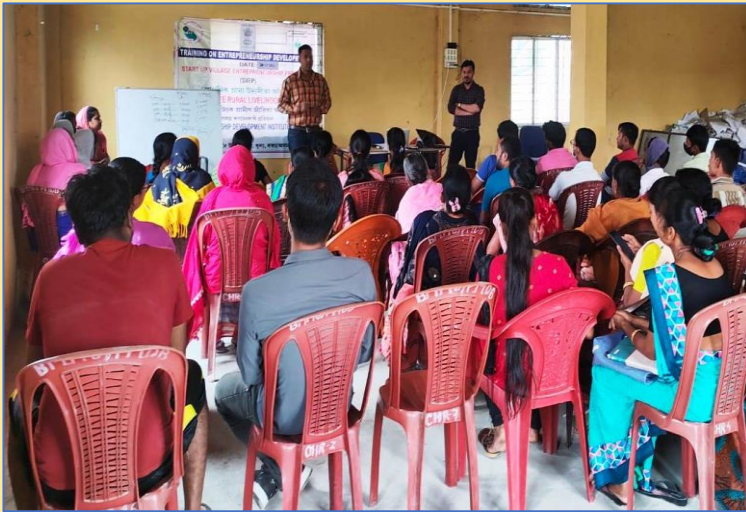
Entrepreneurship Development Training to SVEP Entrepreneurs at Pub Mangaldai, Assam