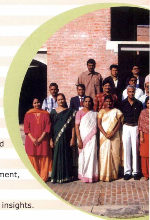
Participants seen with (5th from and FDP Project Incharge and o