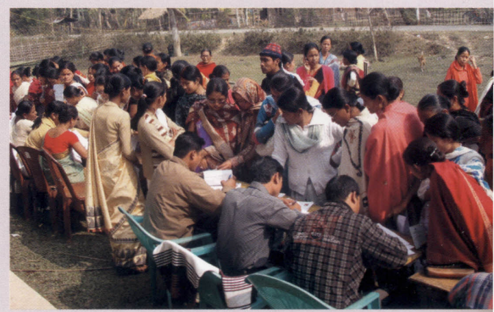
Awareness Camp - Assam

Specifically focusing on Tripura, the Institute intends to take up a cluster development cum trade facilitation project to facilitate holistic development of Micro and Small Enterprise Clusters as also to promote bilateral and multilateral