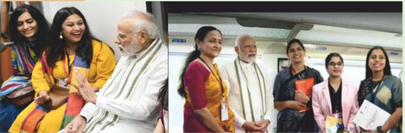
Hon'ble Prime Minister Shri Narendra Modi shared useful tips and gave valuable advice to young Women Entrepreneurs from EDII

Hon'ble Prime Minister, Shri Narendra Modi during his recent visit to the city to inaugurate the 'Vande Bharat Express', met 3 young women entrepreneurs promoted by EDII. These 3 proud women entrepreneurs had the opportunity to interact with Hon'ble Prime Minister about their opportunities, road blocks, helpful resources and the other minute details of their journey.