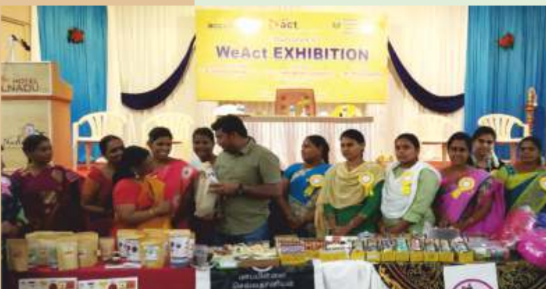
Participants at the exhibition held in Madurai

Women Entrepreneurs - Access Connect Transform (WeAct) is a one-stop