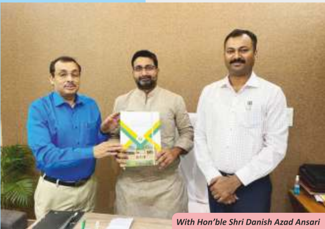
With Hon'ble Shri Danish Azad Ansari