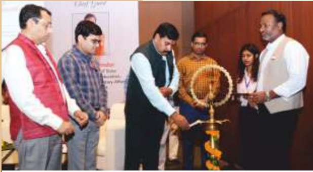
Lighting the ceremonial lamp