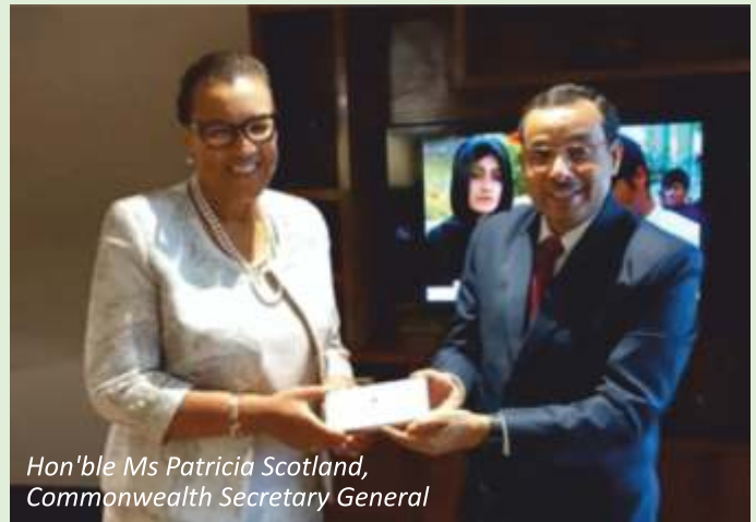
Hon'ble Ms Patricia Scotland, Commonwealth Secretary General

Of course, one of the important mandates of EDII will remain to institutionalize entrepreneurship nationally & globally. Towards this, let me share a recent development. It was a pleasure to meet Commonwealth Secretary General, Hon'ble Ms Patricia Scotland to discuss the proposal on Pacific Islands Entrepreneurship Development Centre in Fiji which would cater to 12 Island nations in Pacific.