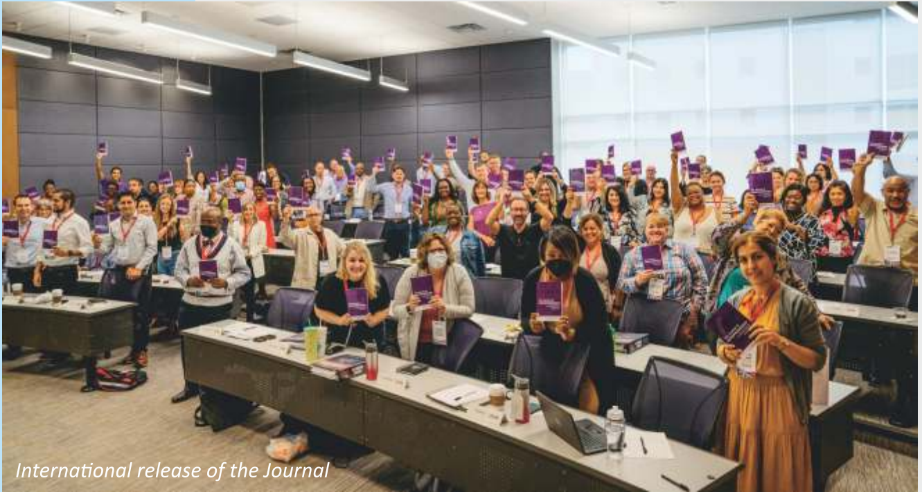
International release of the Journal

The Journal of Entrepreneurship is a multi-disciplinary forum for publication of articles, research and discussions on issues that concern the discipline of entrepreneurship. The Special issue of the Journal of Entrepreneurship emphasizes on tools, techniques and approaches to enhance teaching effectiveness, create innovative classrooms and advance the field of entrepreneurship.