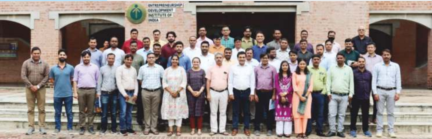
SVEP team at EDII during mentors training and exit workshop