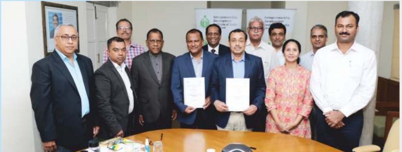
On 23rd August, 2022 : A high-level-Mauritian Delegation led by (3rd from L) Shri Soomilduth Bholah, Hon'ble Minister of Industrial Development, SME & Cooperatives, Republic of Mauritius collaborated with EDII to promote entrepreneurship.