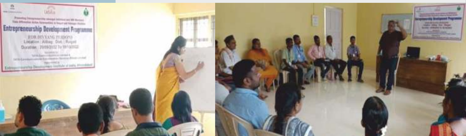
EDP for 'Divyangjan' at Alibaug, in progress

EDII also organized an Entrepreneurship Awareness Camp (EAC) in Alibaug (Raigad district) of Maharashtra sensitizing 69 'Divyangjan' and other stakeholders. Out of these, 26 potential 'Divyang' entrepreneurs were selected and provided training under Entrepreneurship Development Programme.