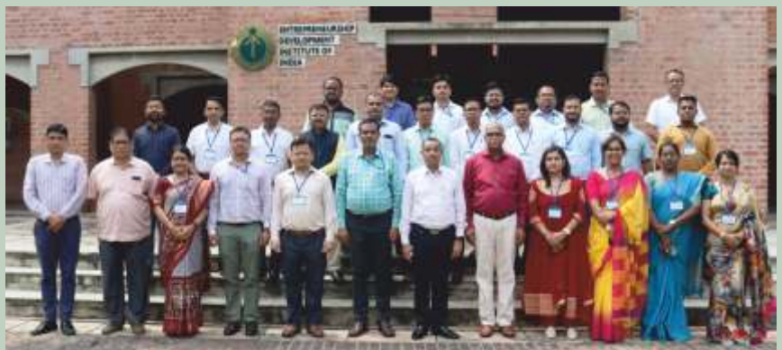
Participants of the Capacity Building Programme on Entrepreneurship Development for officials of Tea Board India

A capacity building programme on Entrepreneurship Development For Officials of Tea Board India was held during 12th to 17th September, 2022 at EDII. The programme was supported by Tea Board India, Ministry of Commerce & Industry, Department of Commerce, Govt. of India. The programme saw participation of about 25 officials and they developed learning and awareness towards maximizing resource utilization for optimum growth. They were introduced to idea generation process, resource mobilization and latest business strategies."