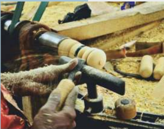
Documentation of the activities pursued by the artisans during the baseline survey

The Ministry of Rural Development (MoRD) has launched the National Rural Economic Transformation Project (NRETP) with an aim to promote cluster development in the farm and non-farm sector. In this regard, EDII, as a Technical Support Agency (TSA) to State Rural Livelihood Missions (SRLMs), is engaged in providing technical assistance to the artisan clusters. This includes conducting scoping studies, DSR preparation and implementation of approved clusters. EDII has been engaged with various SRLMs to function as TSA, particularly for artisan clusters with the objective to improve in parameters like increase in wages, turnover, employment (hours / days / months of engagement), number of enterprises, exports etc. Currently, EDII is engaged for preparation of Scoping Studies and Diagnostic Study Report (DSR) of different clusters with six State Rural Livelihood Mission (SRLMs) viz. Gujarat, Madhya Pradesh, Maharashtra, Rajasthan, West Bengal and Karnataka.