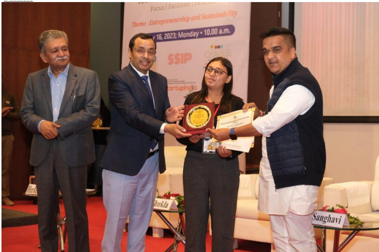
New Delhi/Mumbai/Ahmedabad/Bangalore, January 17, 2023: The Entrepreneurship Development Institute of India (EDII), on Monday, organised its annual entrepreneurship festival— Empresario— on the occasion of National Startup Day. The event was inaugurated