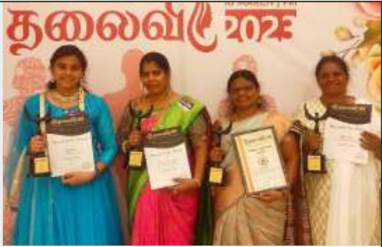
Thalavi Awards 2023 were organised by Tamil Nadu Govt. on 10th March, 2023. 15 women entrepreneurs were nominated for the awards, out of which 4 WSDP women entrepreneurs were awarded as Sheroes of the Year.