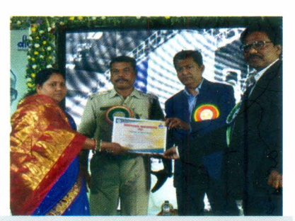
Project Udyamee entrepreneur awarded in MSME exhibition organized by DIC, Rayagada