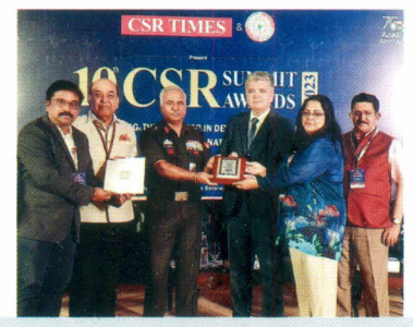
Project Udyamee conferred with '10th CSR Times Silver Award' under the category Sustainable Livelihood Project