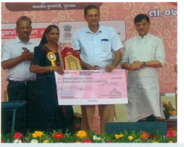
Project HMI beneficiary from Gujarat receiving state award on National Handloom Day