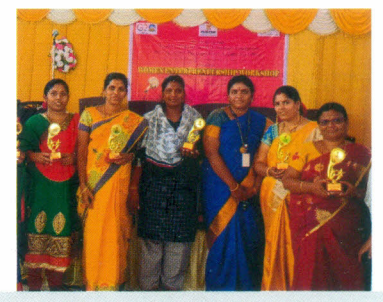
Winners of project HCL Sattva on the occasion of International Women's Day at Madurai