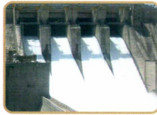
Resources & Power