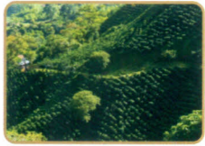
Agriculture & Forest produce