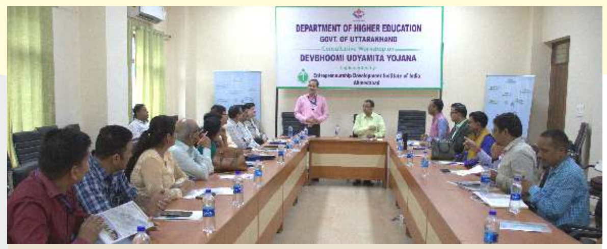
Stakeholders at the consultative workshop, organised in collaboration with the Uttarakhand Higher Education Department. in Dehradun.

On September 13, 2023, at the Nityanand Himalayan Study and Research Centre, Doon University, Dehradun, EDII organized a consultative workshop in collaboration with the Uttarakhand Higher Education Department.