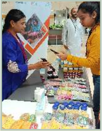
Entrepreneurs exhibiting their products at various exhibitions.