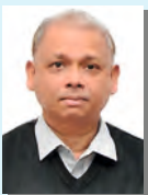
Shri B. B. Swain, IAS Secretary (MSME) Ministry of Micro, Small & Medium Enterprises Government of India New Delhi