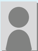
Nominee Industries & Mines Department Government of Gujarat Gandhinagar