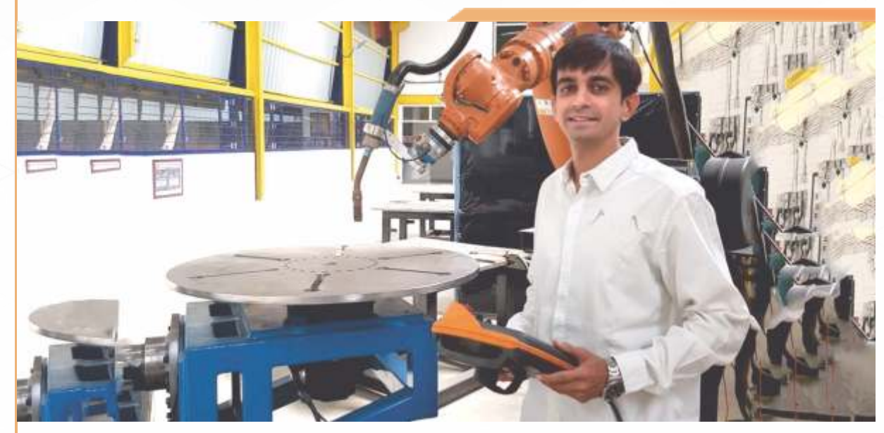
A startup incubated at EDII's Technology Business Incubator.

On 11th March 2024, CrAdLE entered into an MoU with AIC STPINEXT Initiatives (Set up by Software Technology Parks of India to promote technology startup and entrepreneurship ecosystem in the country) to support STPI FinGlobe Centre of Entrepreneurship for Fintech and Banking Industry at STPI, Gift City, Gandhinagar.