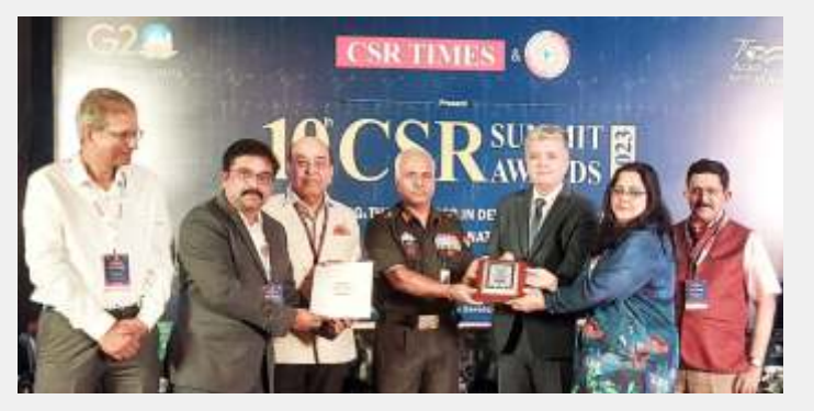
EDII- UTKAL Alumina CSR 'Project Udyamee' conferred with 10th CSR Times Silver Award under the category of 'Sustainable Livelihood Project'.

Utkal Alumina was awarded the prestigious INDIA CSR Award (Winner) for 'Project UDYAMEE' under the category E n t e r p r i s e Development and recognized EDII's work f o r the ir C S R initiatives in creating