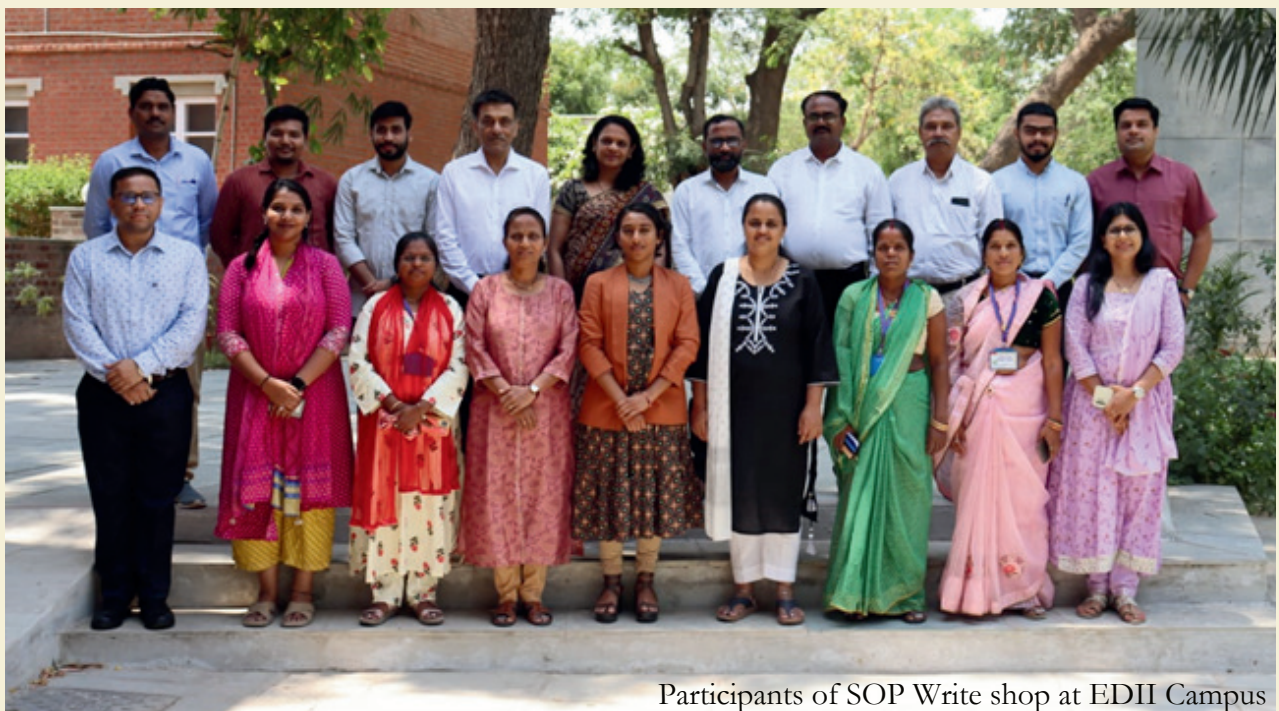
Participants of SOP Write shop at EDII Campus

The EDII organized a 3-day long write-shop from 9th to 11th May 2024 at its Gandhinagar campus to bring together key stakeholders from four states (Maharashtra, Madhya Pradesh, Gujarat and Karnataka) and artisan clusters to discuss and share best practices related to the development of producer companies supporting them. The write shop provided a platform for senior SRLM officials, producer company leaders, and NRLM experts to delve into cluster dynamics, marketing and branding strategies, stakeholder roles and responsibilities, and internal governance structures. The write-shop focused on the techno-managerial capacity building of the producer companies. The aim was to strengthen women-owned and women-led producer collectives to enable them to diversify into high-value artisan commodities. The participants included Senior SRLM non-farm officials from Madhya Pradesh, Karnataka, Gujarat, and Maharashtra; community and producer company leaders from the Kolhapur Chappal Cluster, Dahod Pottery Cluster, Badarwas Jacket Cluster, and Channapatna Wooden Toys Cluster; the National Mission Manager for Non-Farm sectors, and members of the EDII NRO.