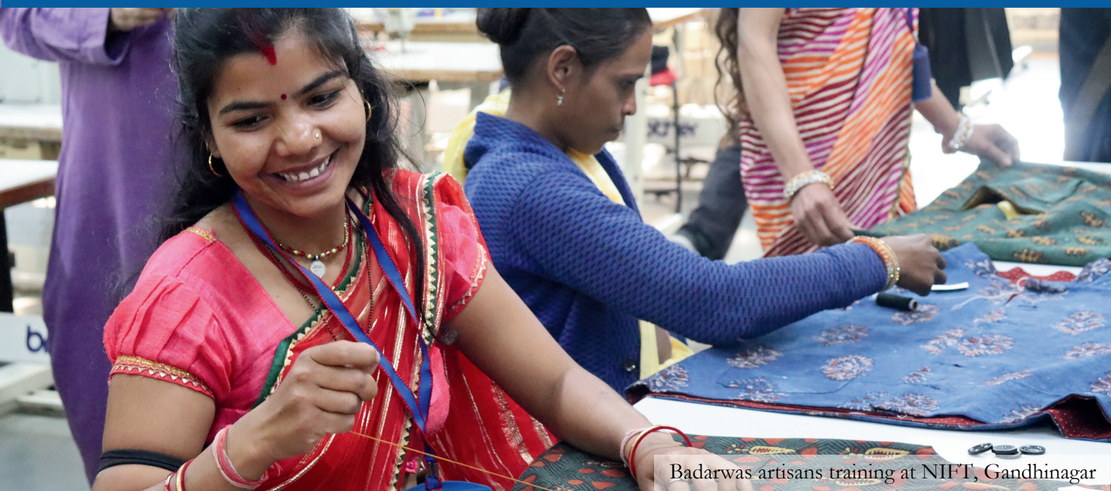
Badarwas artisans training at NIFT, Gandhinagar

Progress from the Field on Implementation of SVEP umbrella projects