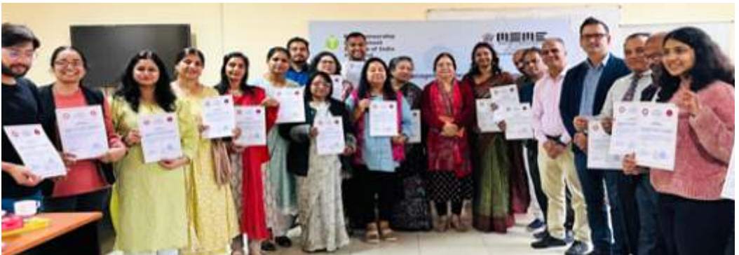
Participants of 1-week Advanced – MDP on Supply Chain Management conducted by EDII Ahmedabad under ESDP scheme of Ministry of MSME, Govt. of India, at Dehradun, Uttarakhand receiving the completion certificates.