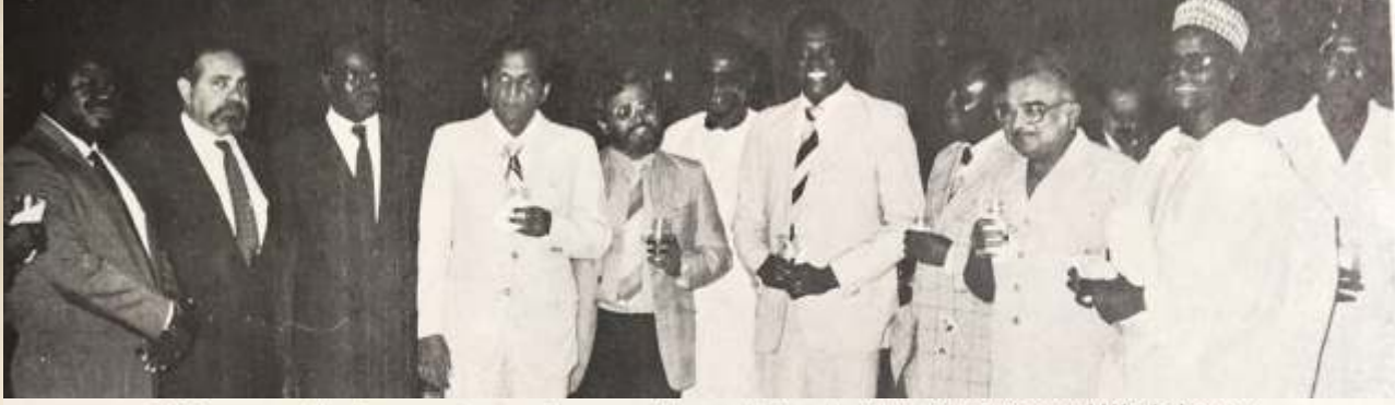
EDI-I team with the organisers and some of the participants of the Inter Regional Workshop on Entrepreneurship Development held at Abidjan for the francophone countries of Africa.

SPECIAL FEATURE INTER-REGIONAL WORKSHOP ON ENTREPRENEURSHIP DEVELOPMENT FOR FRENCH-SPEAKING AFRICAN COUNTRIES HELD IN ABIDJAN