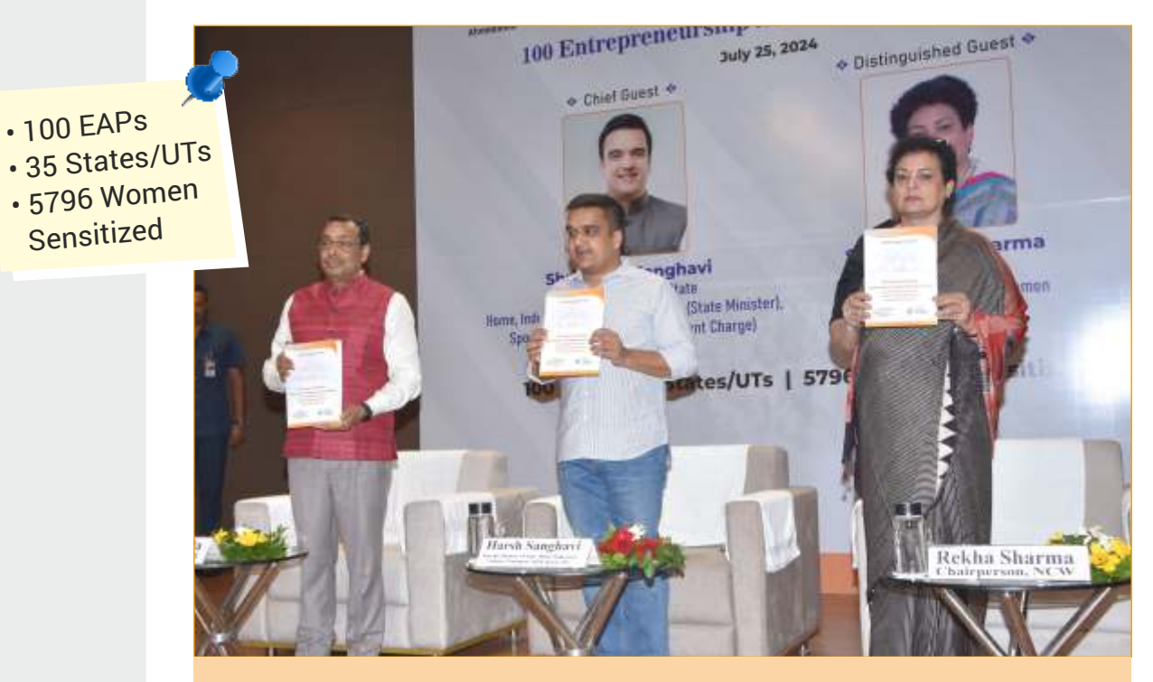
Project Completion Report being released on the occasion.