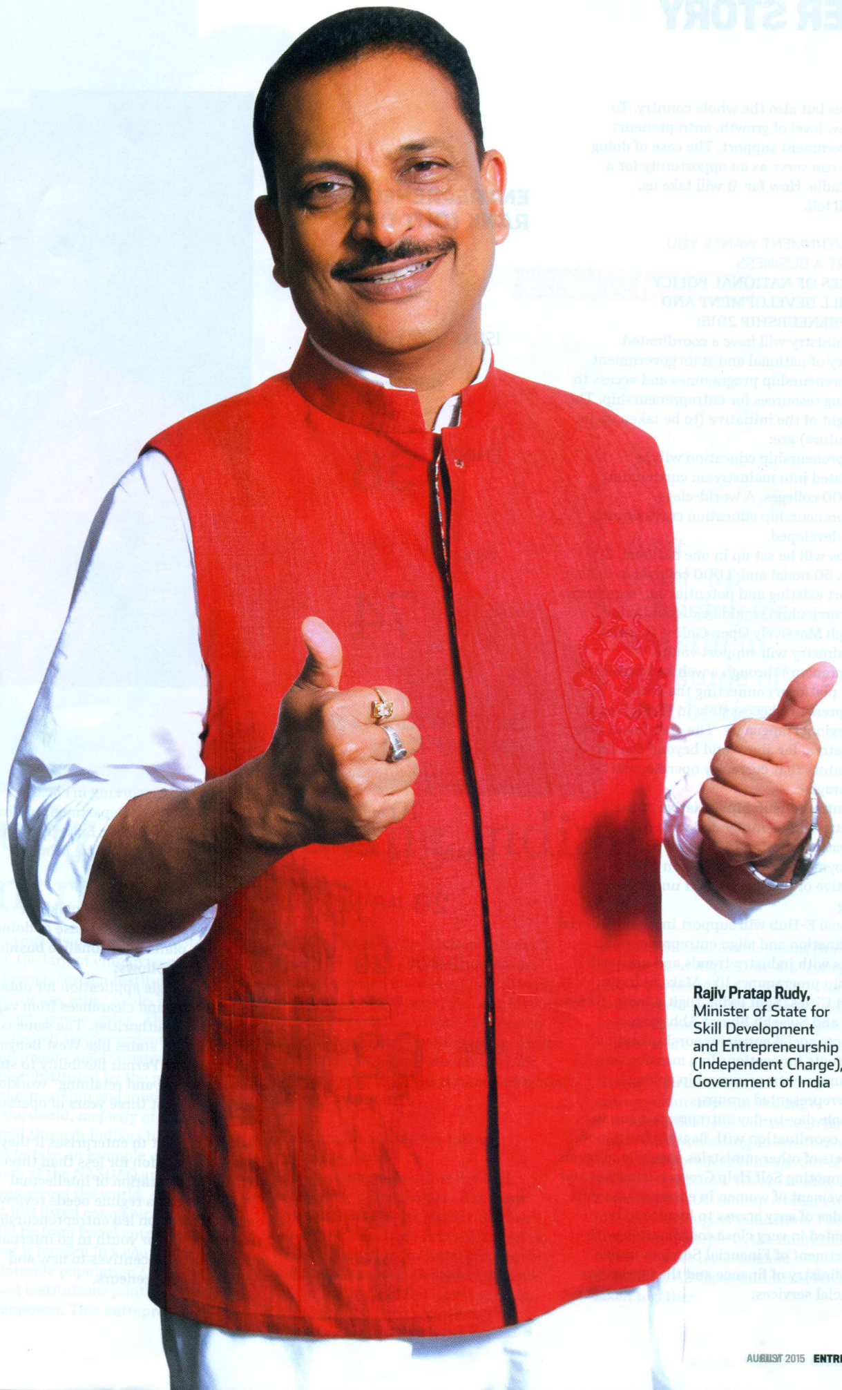
Rajiv Pratap Rudy, Minister of State for Skill Development and Entrepreneurship (Independent Charge), Government of India