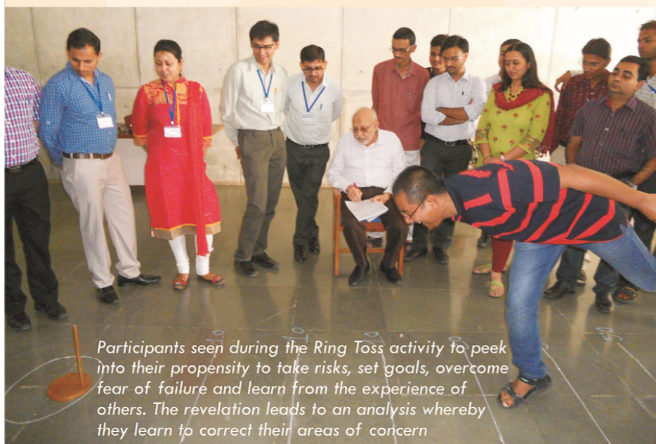
Participants seen during the Ring Toss activity to peek into their propensity to take risks, set goals, overcome fear of failure and learn from the experience of others. The revelation leads to an analysis whereby they learn to correct their areas of concern