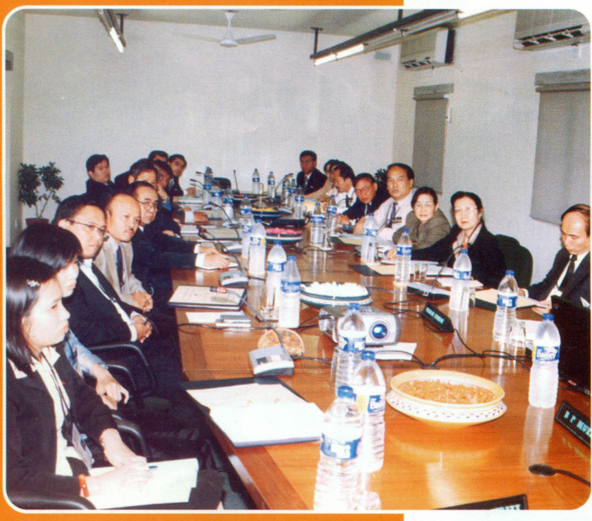
International delegates seen attending one of the sessions

The role of Small and Medium Enterprises (SMEs) in economic development and employment generation is proved beyond doubt and every developing economy is now opening its doors to young entrepreneurs with viable business ideas. However, the right atmosphere, conducive to growth and development is a must. For the 21 delegates from Cambodia, Indonesia, Lao PDR, Myanmar, Philippines, Singapore and Vietnam, lessons in entrepreneurship development were a new avenue, not fully explored in their nations. This workshop, therefore, intended to acquaint them with the