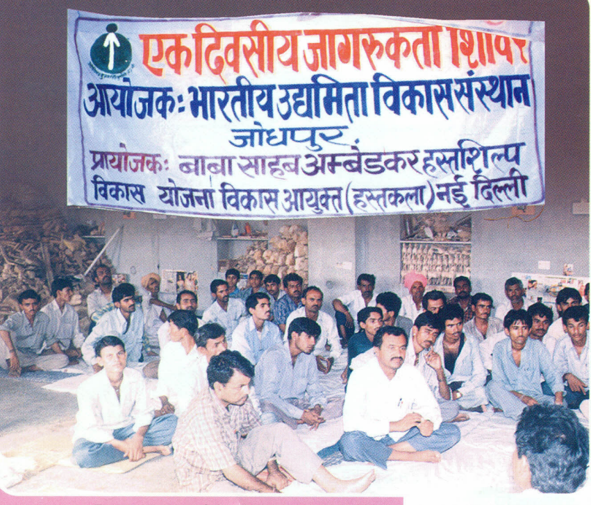
Participants of the Sensitisation Programme at Jodhpur

Declining clusters might have severe limitations on both fronts and interventions with regard to encouraging greater co-operation and synergised efforts in certain areas viz. capacity building of associations, synergising roles of institutions with SMEs etc. may have to be particularly pursued in the context of growing as well as stagnant clusters. Cluster Development activities in India, although in a nascent stage, are being given a boost by the entrepreneurial endeavours of EDI. Its efforts in Jamnagar, Rajkot, Allepy and Nagaland