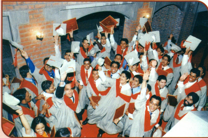
Exhilarated students after the Convocation

technology and markets and a growing world economy, is what he saw as bringing in a cutting edge competitiveness. And this is where he saw the significance of entrepreneurial enterprise.