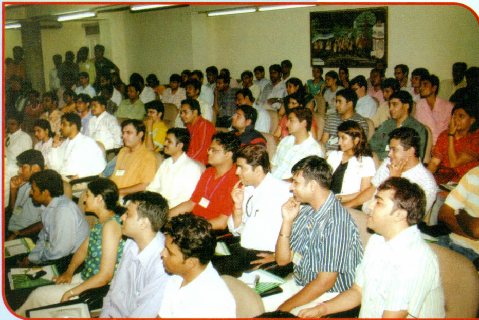
EDI Alumni engrossed in a session