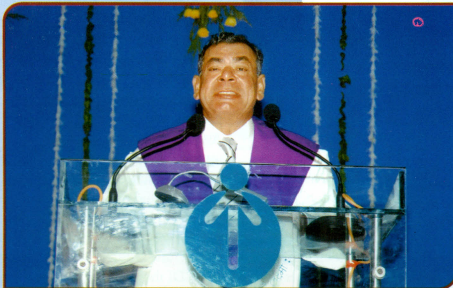
The Chief Guest delivering the convocation address