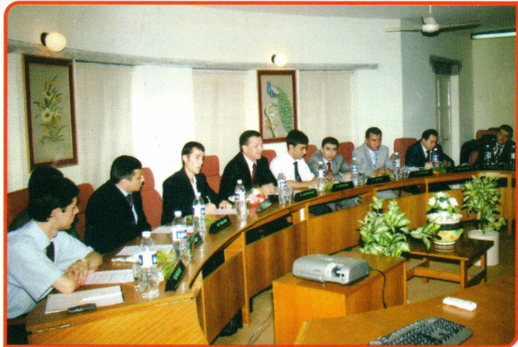
Uzbek delegates during interaction at EDI

business opportunities relevant to local conditions will also be subsequently taken up.