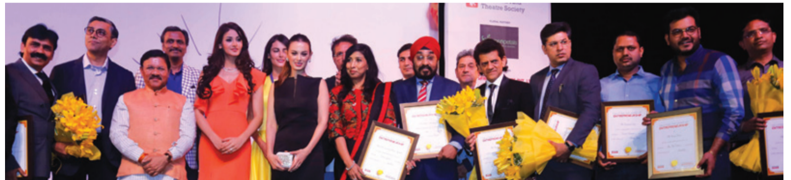
Saluting the Spirit of Entrepreneurship by Optimal Media Solutions, A Division of Times Internet Ltd., A Times Group Company