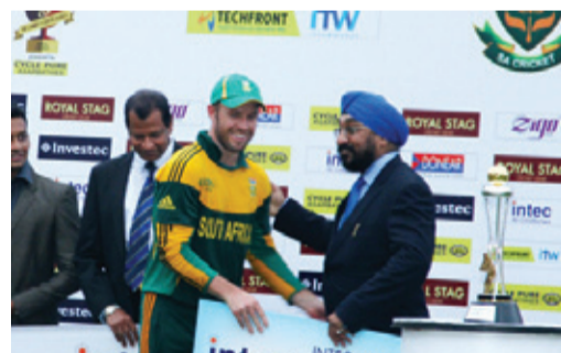
Intec Sponsored South Africa Vs Sri Lanka Match in 2014