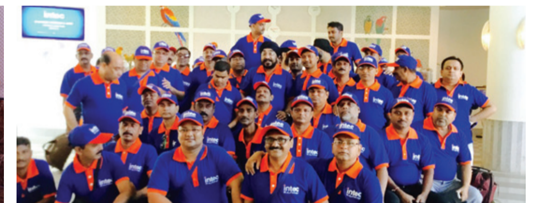
Intec's Channel Partners Meet, 2016 in Pattaya, Thailand