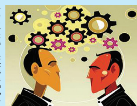
What majority of influential people in startup sector have to say in a first-of-its-kind survey, there is no better time than now to begin a career in entrepreneurship.

agreed to do so on condition of anonymity, allowing themselves the freedom to express their views candidly.