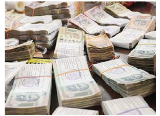
288 start-ups cumulatively raised $1.36 billion in Q3; lowest till now: Xeler8

The top funding deals include Hike ($175 million), Oyo Rooms ($123 million) and BookMyShow ($81.6 million), it said adding that top investors in the quarter