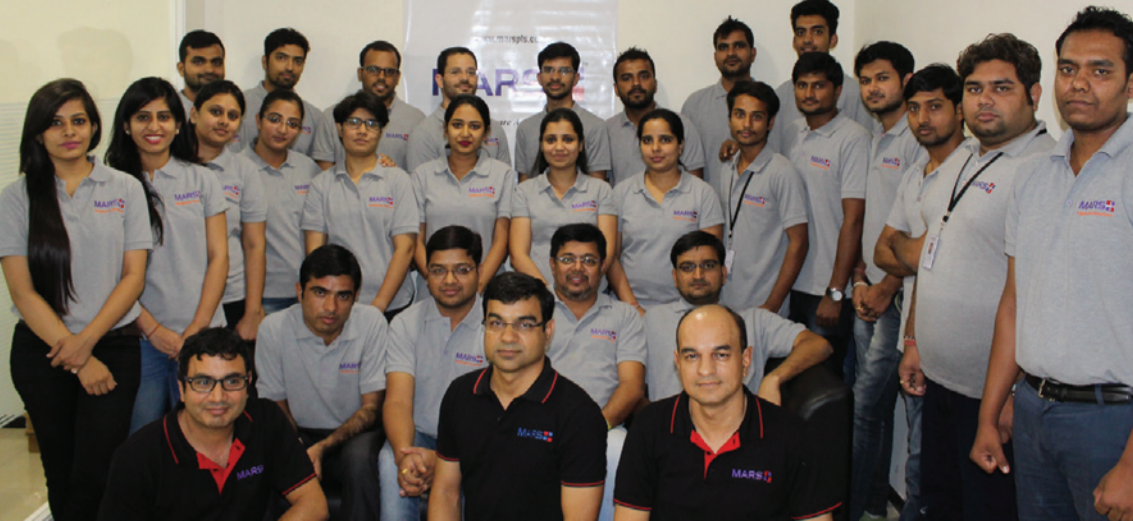
MARS Plus Team