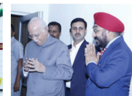
At the Book launch event "Chakravayuh" in New Delhi, 2016