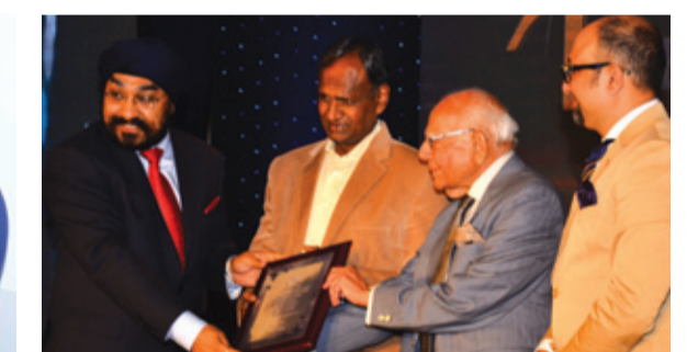
Admired leader of India 2014-15 by VWP World Brands